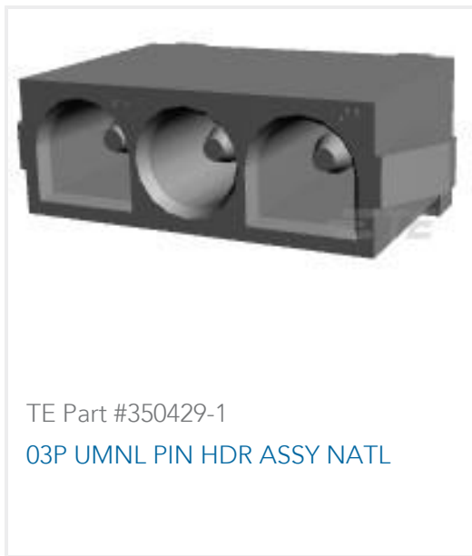
TE Part #350429-1 03P UMNL PIN HDR ASSY NATL