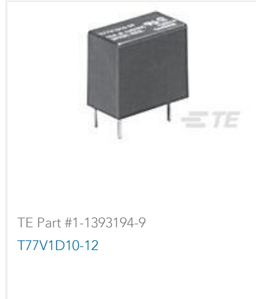
TE Part #1-1393194-9 T77V1D10-12