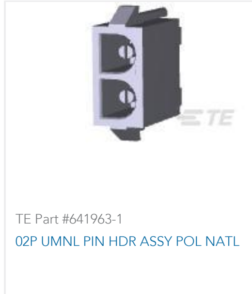
TE Part #641963-1 02P UMNL PIN HDR ASSY POL NATL