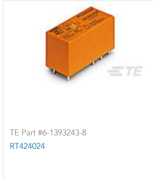
TE Part #6-1393243-8 RT424024