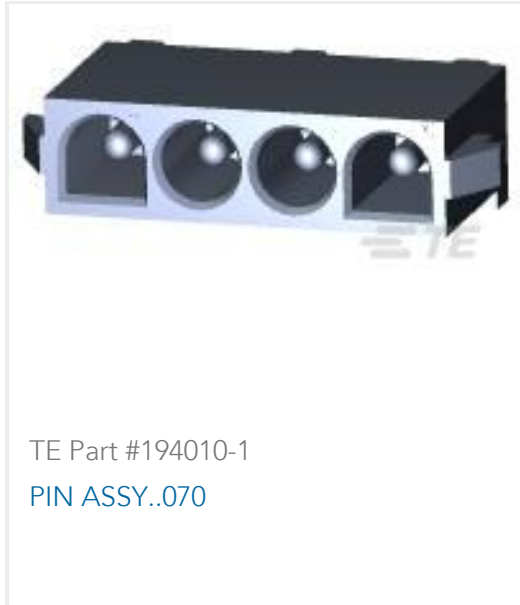
TE Part #194010-1 PIN ASSY..070