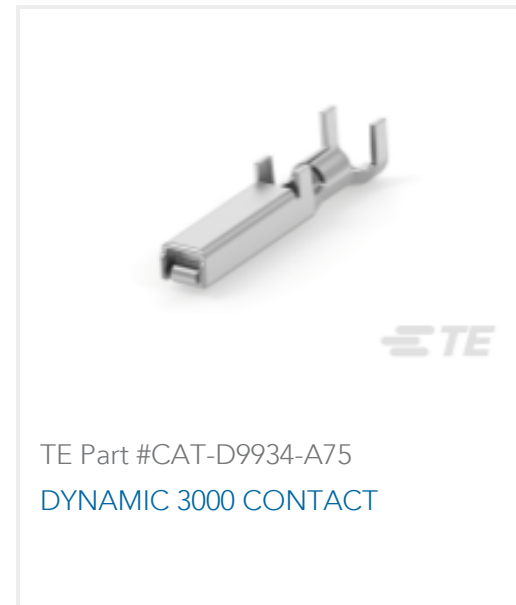
TE Part #CAT-D9934-A75 DYNAMIC 3000 CONTACT