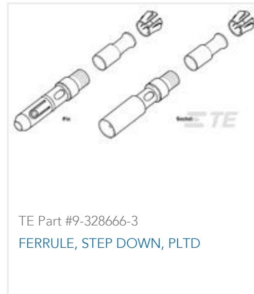
TE Part #9-328666-3 FERRULE, STEP DOWN, PLTD