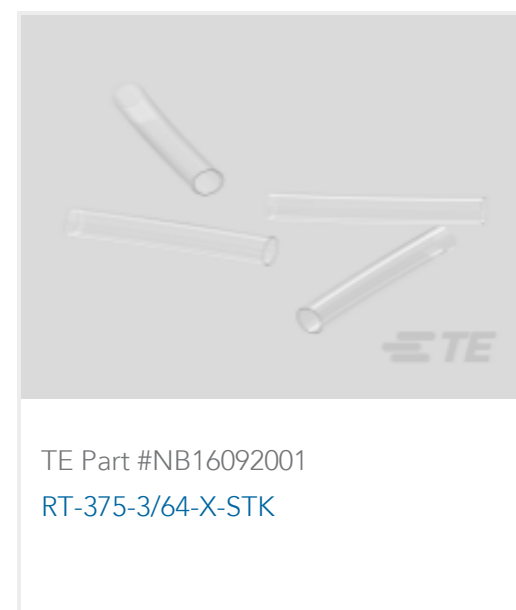
TE Part #NB16092001 RT-375-3/64-X-STK