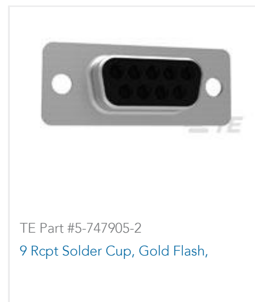
TE Part #5-747905-2 9 Rcpt Solder Cup, Gold Flash,