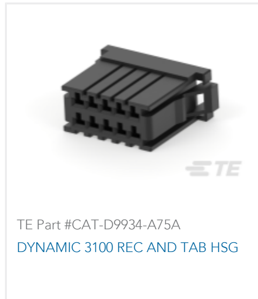
TE Part #CAT-D9934-A75A DYNAMIC 3100 REC AND TAB HSG