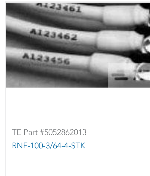
TE Part #5052862013 RNF-100-3/64-4-STK