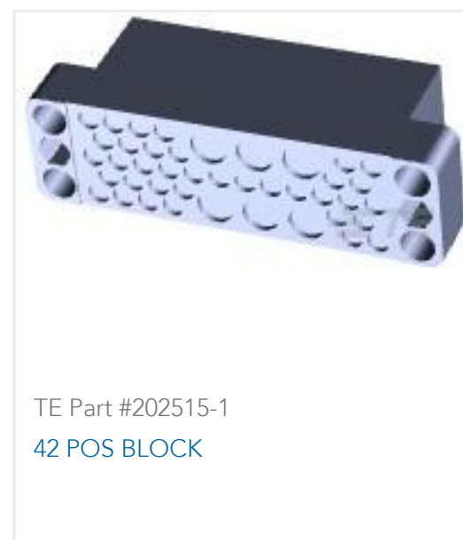
TE Part #202515-1 42 POS BLOCK