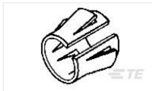
TE Part #201142-2 RETENTION SPRING, PLTD