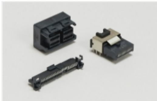
SAS & MiniSAS(30)