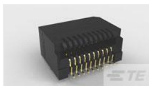
TE Part #1888247-1 20 POS SMT CONN, SFP/SFP+, 30A