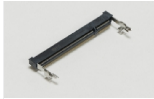
SO DIMM Sockets(3)