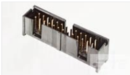
TE Part #5103308-3 A/L LOW PRO HDR 16P VERT BLACK