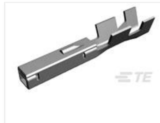
TE Part #917308-1 MINI MLC CONN REC CONT.