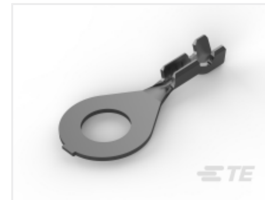
TE Part #964197-1 AM RINGZUNGE MIF