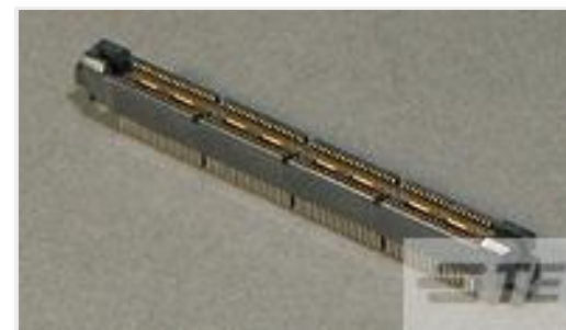
TE Part #5767006-4 MICT,R/APLUG,152,ASY,.025,.062