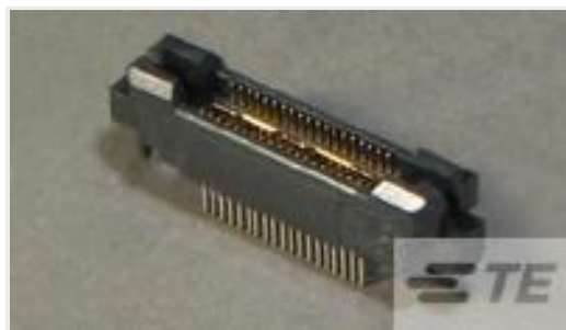
TE Part #5767055-1 MICT,R/APLUG,ASSY,38,PDNI