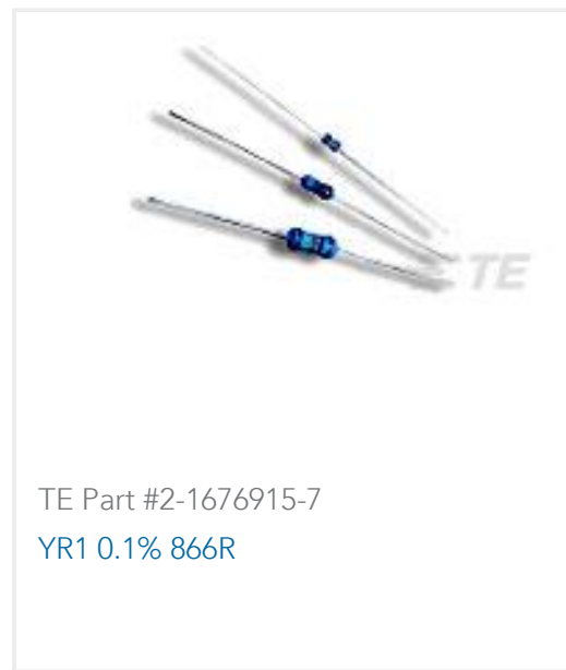
TE Part #2-1676915-7 YR1 0.1% 866R