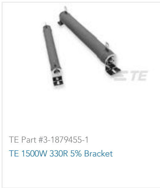
TE Part #3-1879455-1 TE 1500W 330R 5% Bracket