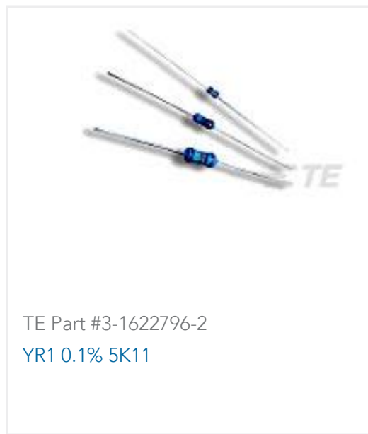
TE Part #3-1622796-2 YR1 0.1% 5K11