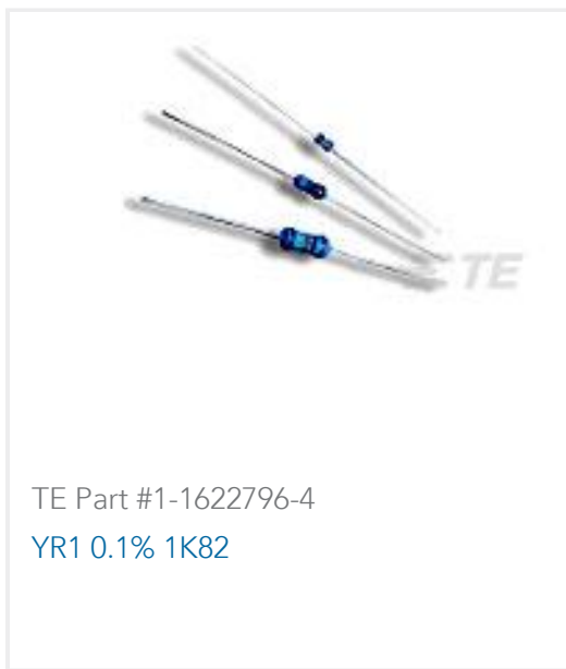
TE Part #1-1622796-4 YR1 0.1% 1K82