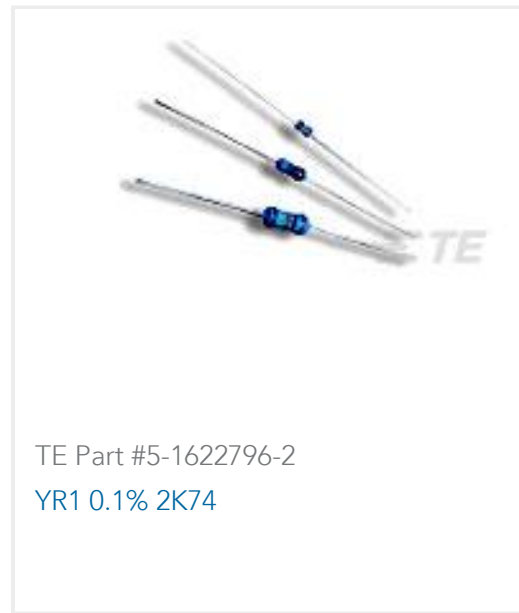
TE Part #5-1622796-2 YR1 0.1% 2K74