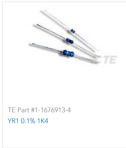
TE Part #1-1676913-4 YR1 0.1% 1K4