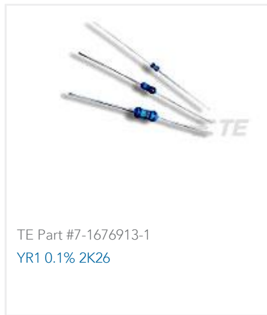
TE Part #7-1676913-1 YR1 0.1% 2K26