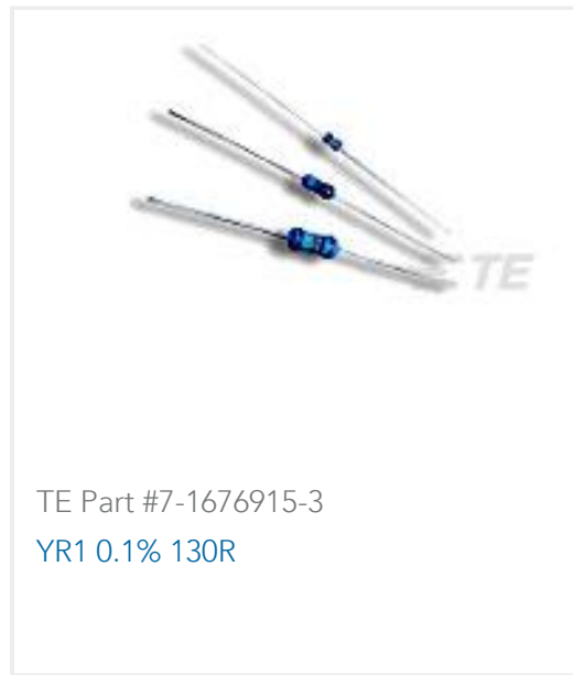
TE Part #7-1676915-3 YR1 0.1% 130R