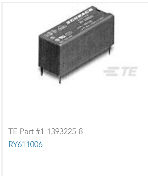
TE Part #1-1393225-8 RY611006