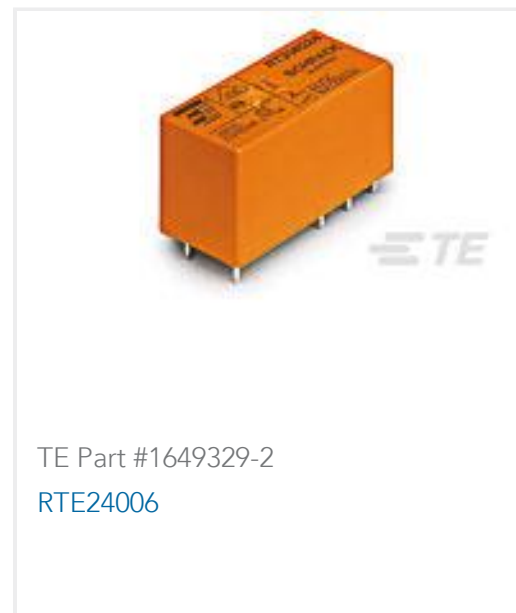
TE Part #1649329-2 RTE24006