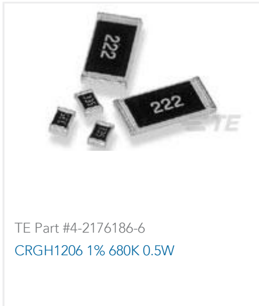
TE Part #4-2176186-6 CRGH1206 1% 680K 0.5W