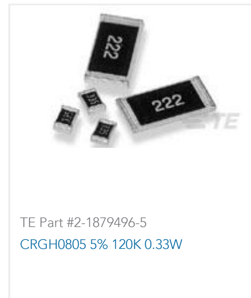
TE Part #2-1879496-5 CRGH0805 5% 120K 0.33W