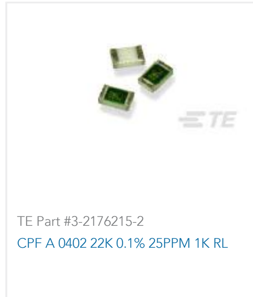
TE Part #3-2176215-2 CPF A 0402 22K 0.1% 25PPM 1K RL