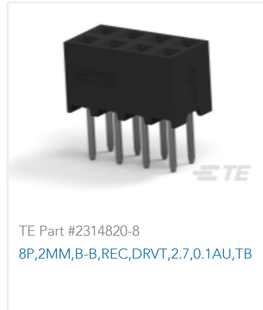
TE Part #2314820-8 8P,2MM,B-B,REC,DRVT,2.7,0.1AU,TB