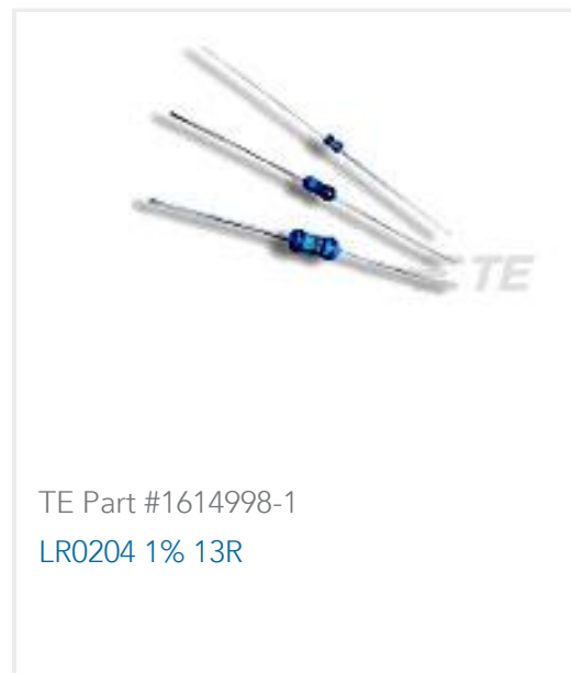
TE Part #1614998-1 LR0204 1% 13R