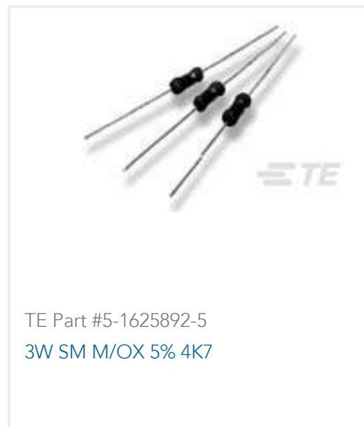
TE Part #5-1625892-5 3W SM M/OX 5% 4K7