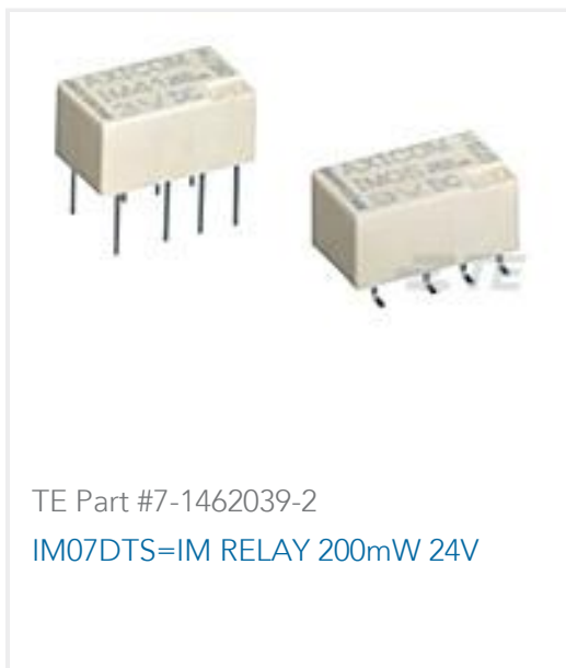
TE Part #7-1462039-2 IM07DTS=IM RELAY 200mW 24V