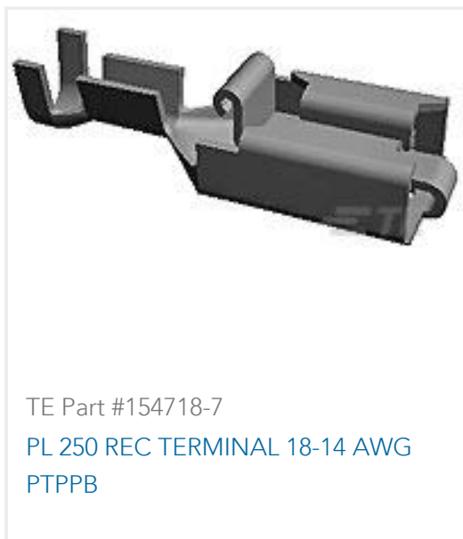
TE Part #154718-7 PL 250 REC TERMINAL 18-14 AWG PTPPB