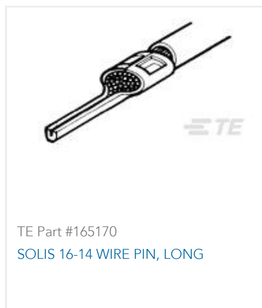
TE Part #165170 SOLIS 16-14 WIRE PIN, LONG