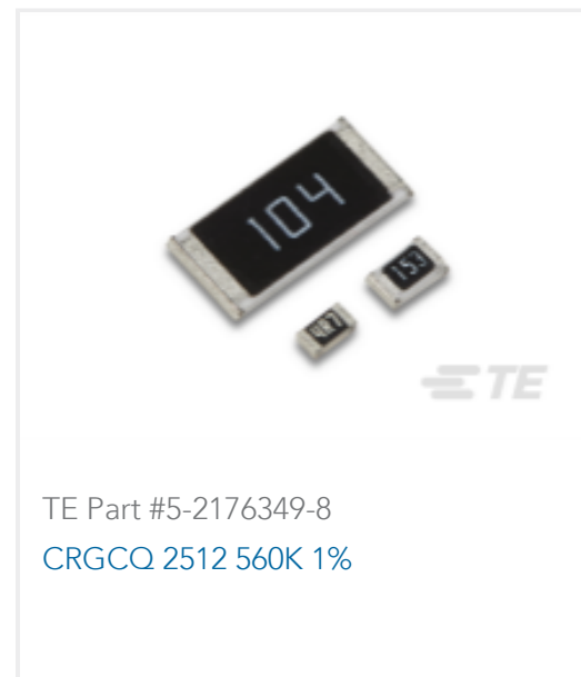
TE Part #5-2176349-8 CRGCO 2512 560K 1%