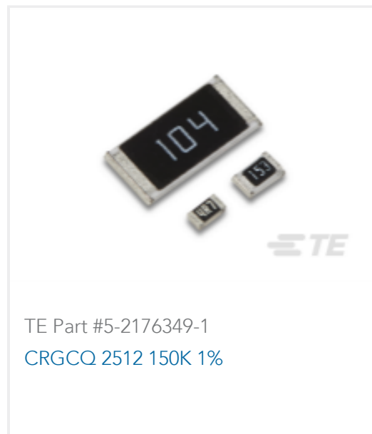
TE Part #5-2176349-1 CRGCO 2512 150K 1%