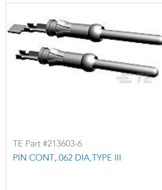
TE Part #213603-6 PIN CONT, .062 DIA, TYPE III