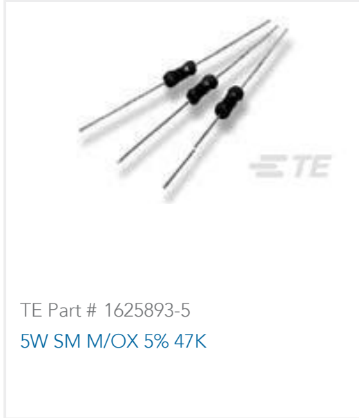
TE Part # 1625893-5 5W SM M/OX 5% 47K