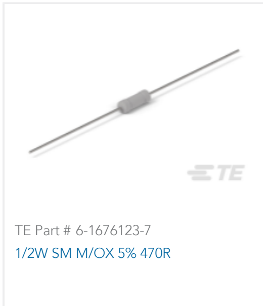
TE Part # 6-1676123-7 1/2W SM M/OX 5% 470R