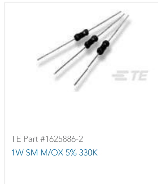
TE Part #1625886-2 1W SM M/OX 5% 330K