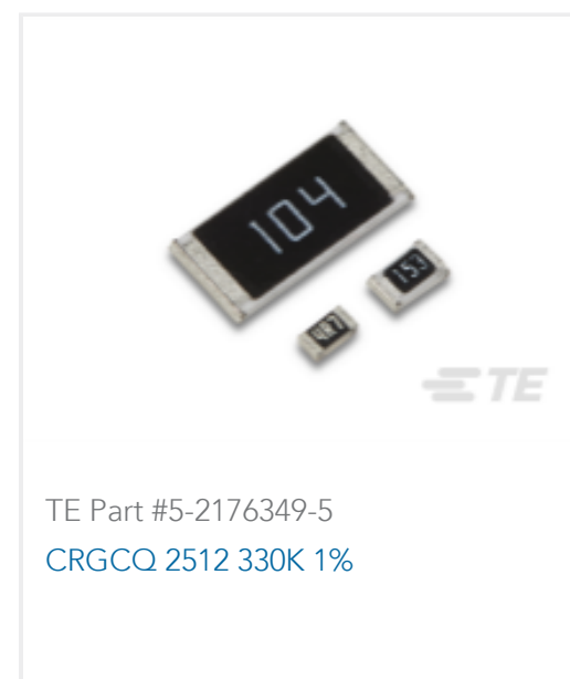
TE Part #5-2176349-5 CRGCO 2512 330K 1%