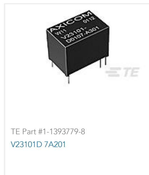
TE Part #1-1393779-8 V23101D 7A201