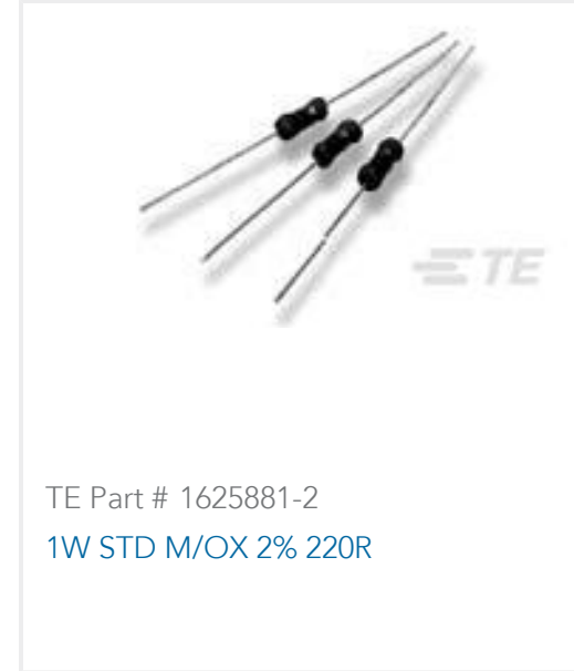
TE Part # 1625881-2 1W STD M/OX 2% 220R