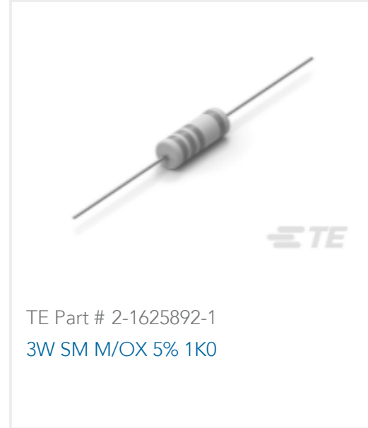
TE Part # 2-1625892-1 3W SM M/OX 5% 1K0