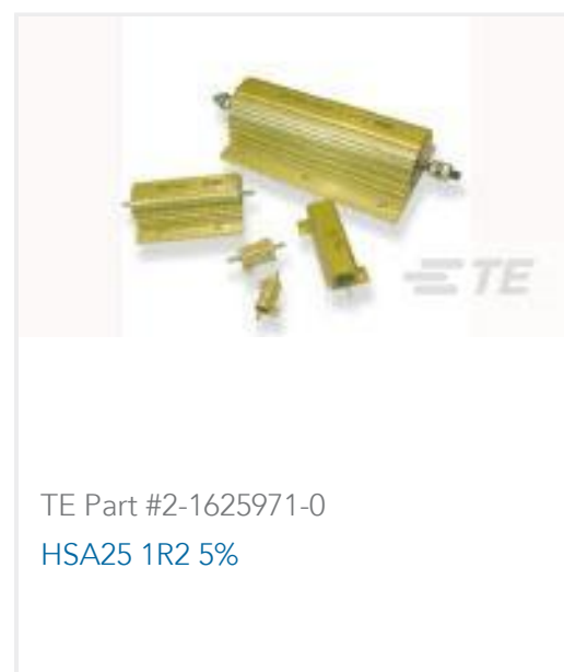
TE Part #2-1625971-0 HSA25 1R2 5%