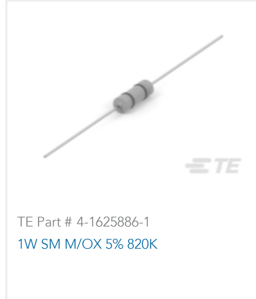
TE Part # 4-1625886-1 1W SM M/OX 5% 820K