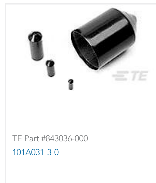
TE Part #843036-000 101A031-3-0