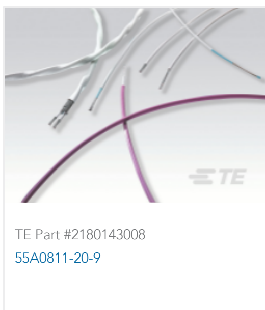
TE Part #2180143008 55A0811-20-9