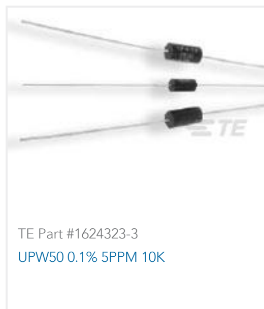
TE Part #1624323-3 UPW50 0.1% 5PPM 10K