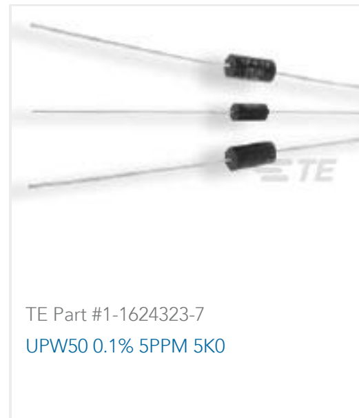
TE Part #1-1624323-7 UPW50 0.1% 5PPM 5K0