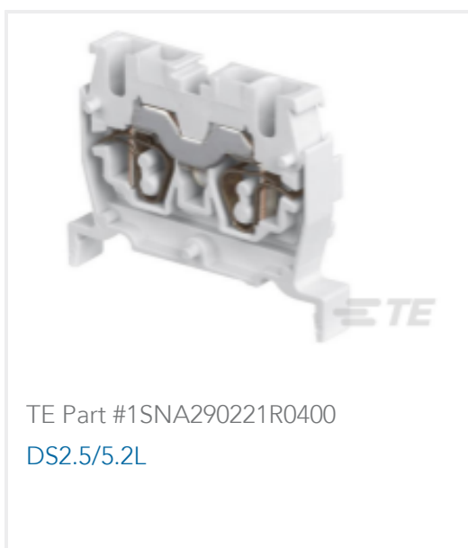
TE Part #1SNA290221R0400 DS2.5/5.2L