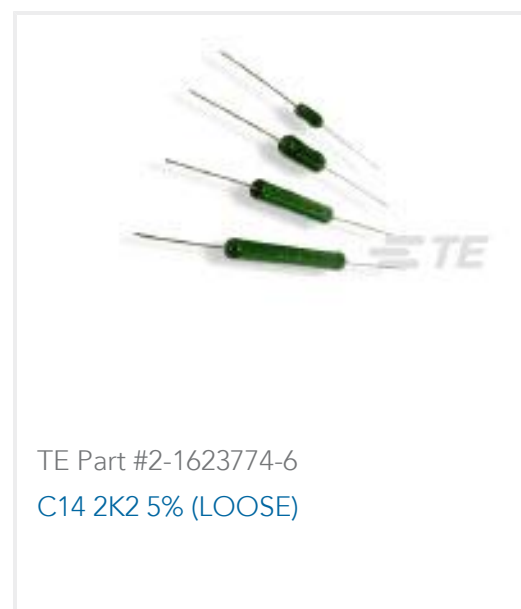
TE Part #2-1623774-6 C14 2K2 5% (LOOSE)