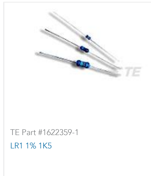
TE Part #1622359-1 LR1 1% 1K5