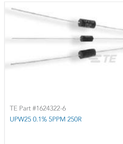
TE Part #1624322-6 UPW25 0.1% 5PPM 250R