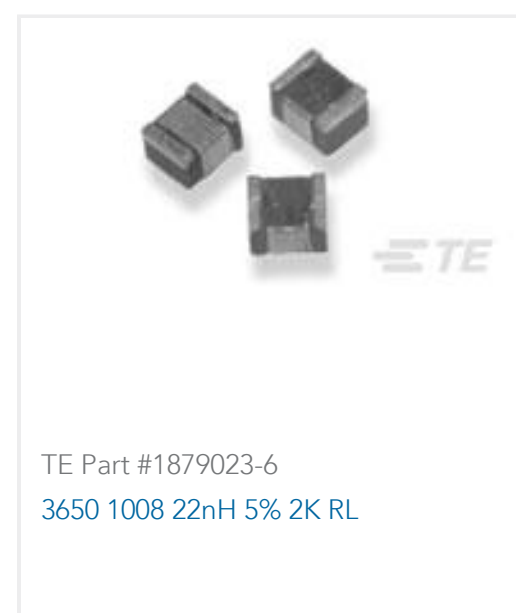
TE Part #1879023-6 3650 1008 22nH 5% 2K RL