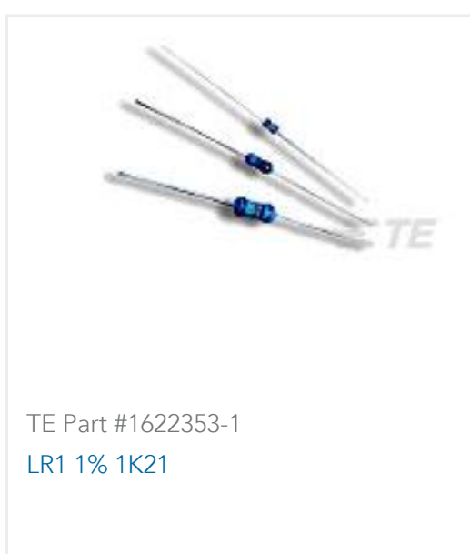
TE Part #1622353-1 LR1 1% 1K21