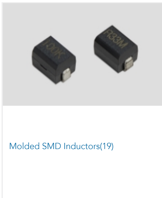
Molded SMD Inductors(19)