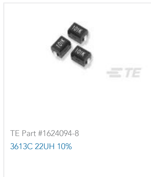
TE Part #1624094-8 3613C 22UH 10%