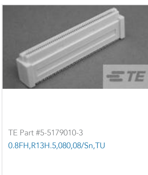
TE Part #5-5179010-3 0.8FH,R13H.5.080,08/Sn,TU