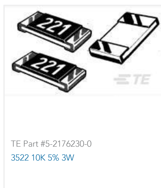
TE Part #5-2176230-0 3522 10K 5% 3W