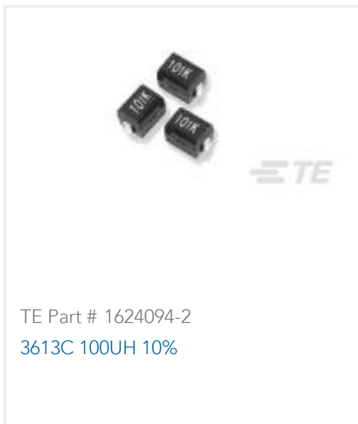
TE Part # 1624094-2 3613C 100UH 10%