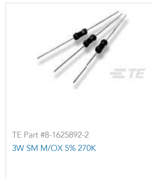
TE Part #8-1625892-2 3W SM M/OX 5% 270K