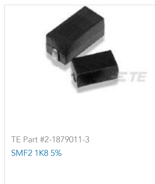
TE Part #2-1879011-3 SMF2 1K8 5%