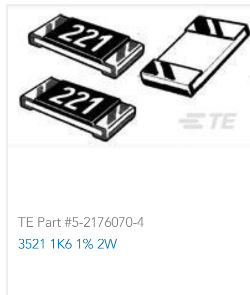
TE Part #5-2176070-4 3521 1K6 1% 2W