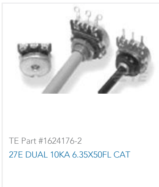
TE Part #1624176-2 27E DUAL 10KA 6.35X50FL CAT