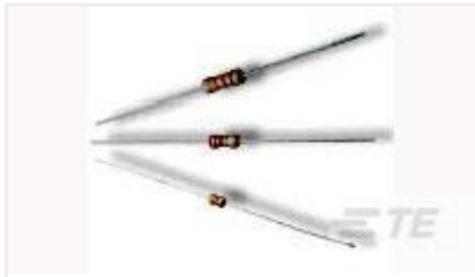
TE Part # 1623927-8 CFR16 5% 120R