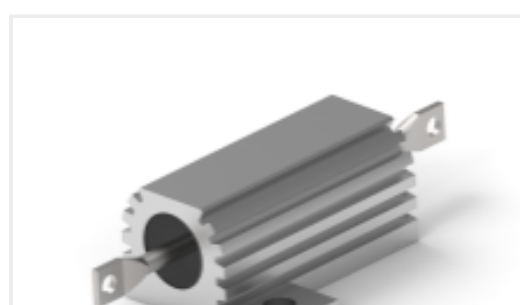
TE Part #CAT-C339-T419 Power Resistor: Aluminum Housed, 75 Watt