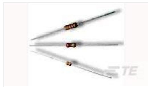
TE Part # 1623925-2 CFR100 5% 100R