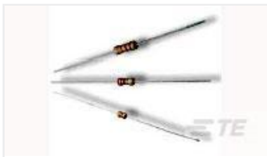
TE Part # 1623932-8 CFR50 5% 10K