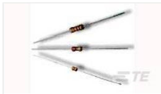
TE Part # 2-1623929-2 CFR200 5% 22K