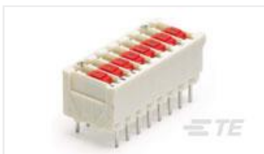
TE Part #5161390-4 04P.DIP SWITCH ASSY