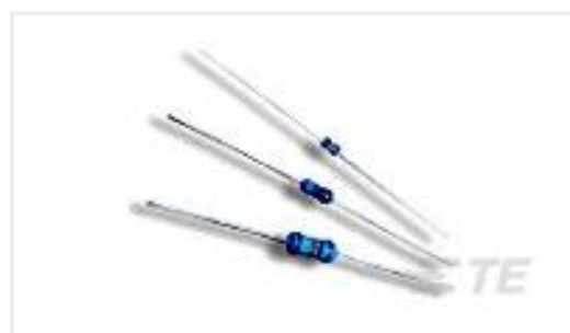
TE Part #1622342-2 LR1 1% 180R