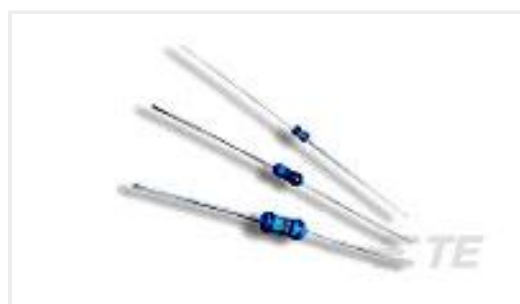
TE Part #1622511-1 LR1 1% 51R