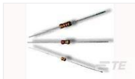
TE Part #2-1623929-3 CFR200 5% 22R