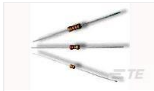
TE Part # 1623930-3 CFR25 5% 10K