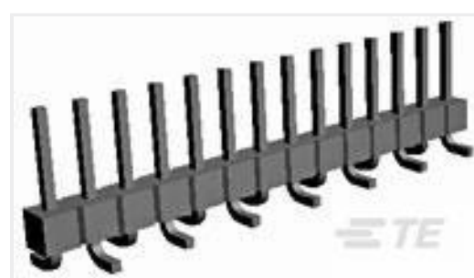
TE Part #1241150-5 5P MOD II BREAK AWAY HDR , SMD, BLISTER