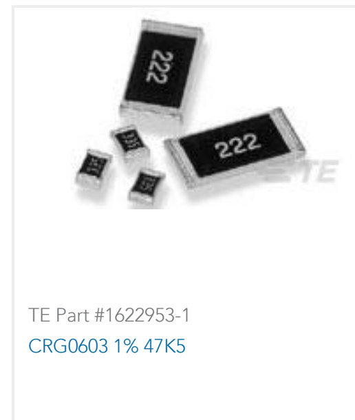
TE Part #1622953-1 CRG0603 1% 47K5