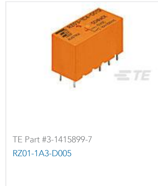
TE Part #3-1415899-7 RZ01-1A3-D005