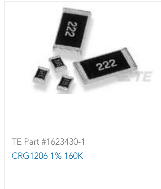
TE Part #1623430-1 CRG1206 1% 160K