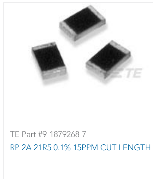
TE Part #9-1879268-7 RP 2A 21R5 0.1% 15PPM CUT LENGTH