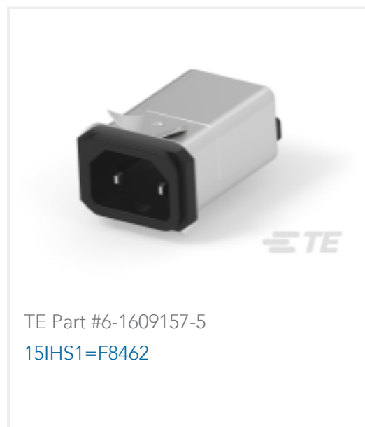
TE Part #6-1609157-5 15IHS1=F8462