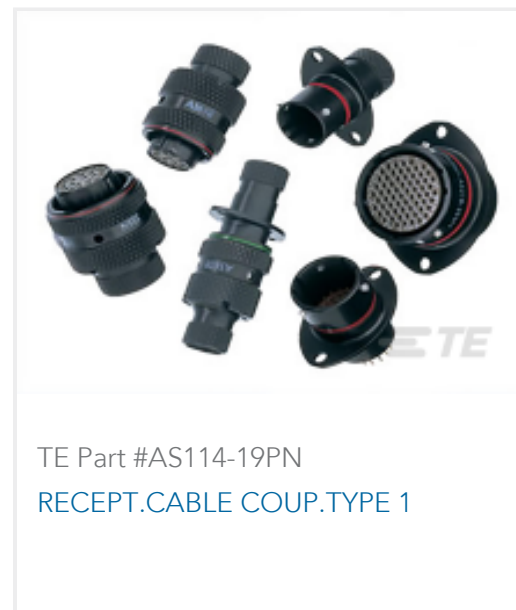
TE Part #AS114-19PN RECEPT.CABLE COUP.TYPE 1