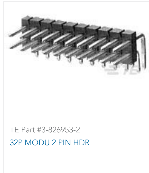
TE Part #3-826953-2 32P MODU 2 PIN HDR