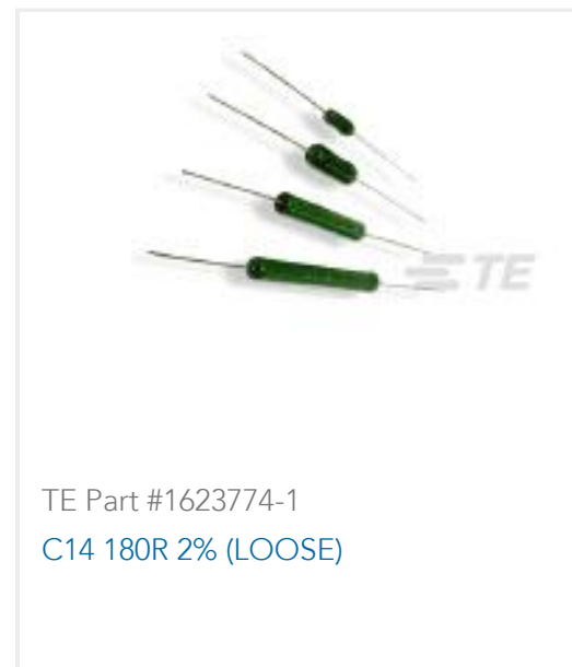
TE Part #1623774-1 C14 180R 2% (LOOSE)