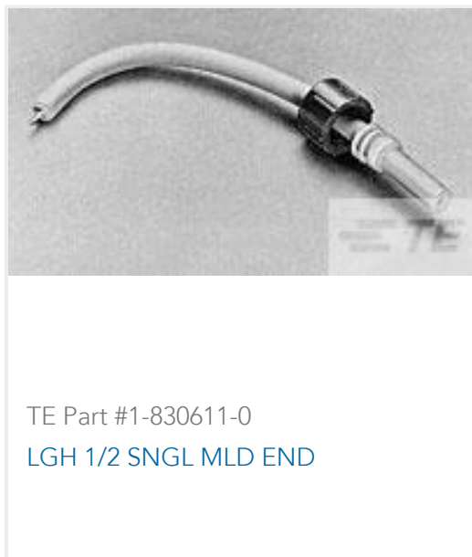
TE Part #1-830611-0 LGH 1/2 SNGL MLD END