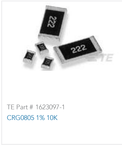
TE Part # 1623097-1 CRG0805 1% 10K