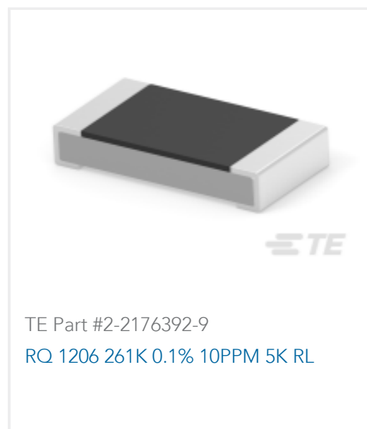
TE Part #2-2176392-9 RQ 1206 261K 0.1% 10PPM 5K RL