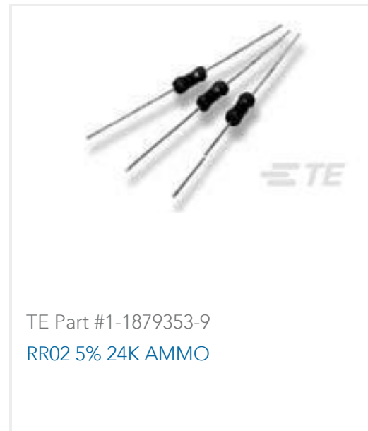
TE Part #1-1879353-9 RR02 5% 24K AMMO