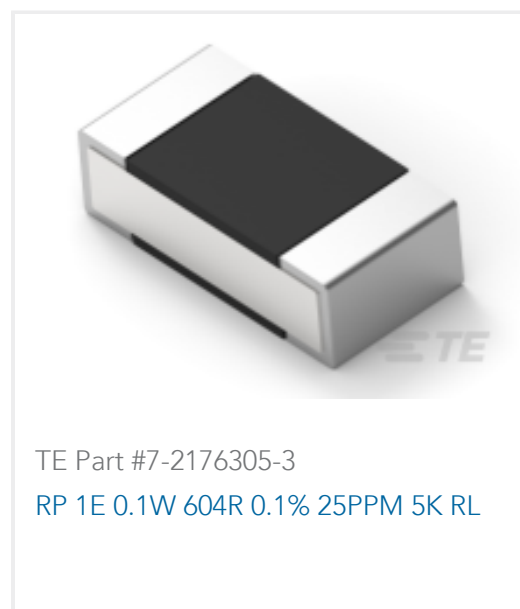
TE Part #7-2176305-3 RP 1E 0.1W 604R 0.1% 25PPM 5K RL