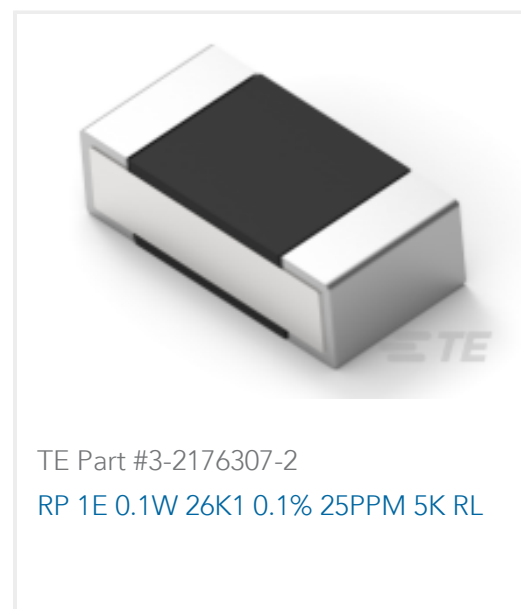
TE Part #3-2176307-2 RP 1E 0.1W 26K1 0.1% 25PPM 5K RL