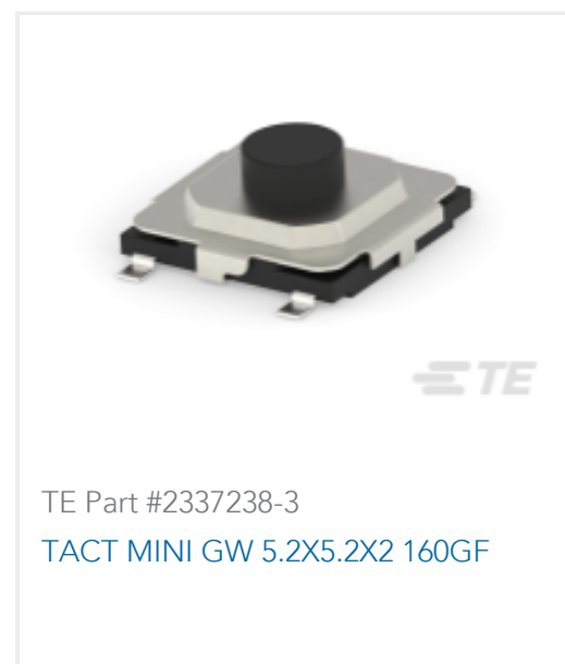
TE Part #2337238-3 TACT MINI GW 5.2X5.2X2 160GF