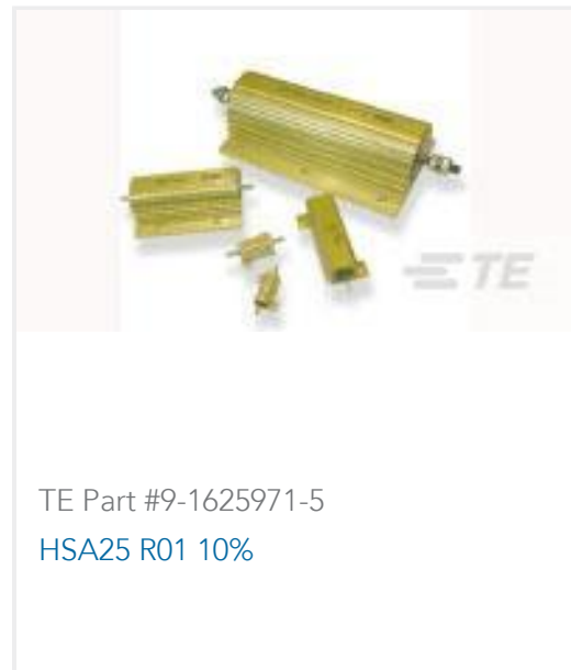
TE Part #9-1625971-5 HSA25 R01 10%