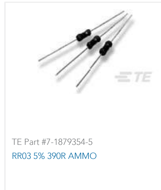
TE Part #7-1879354-5 RR03 5% 390R AMMO