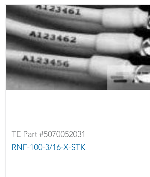
TE Part #5070052031 RNF-100-3/16-X-STK