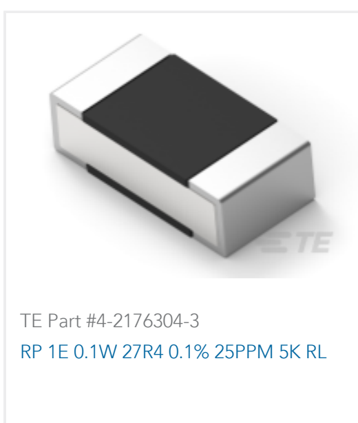
TE Part #4-2176304-3 RP 1E 0.1W 27R4 0.1% 25PPM 5K RL