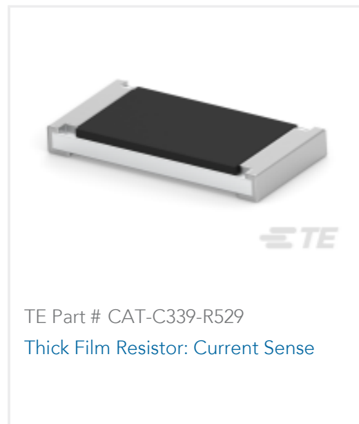
TE Part # CAT-C339-R529 Thick Film Resistor: Current Sense