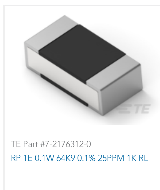
TE Part #7-2176312-0 RP 1E 0.1W 64K9 0.1% 25PPM 1K RL