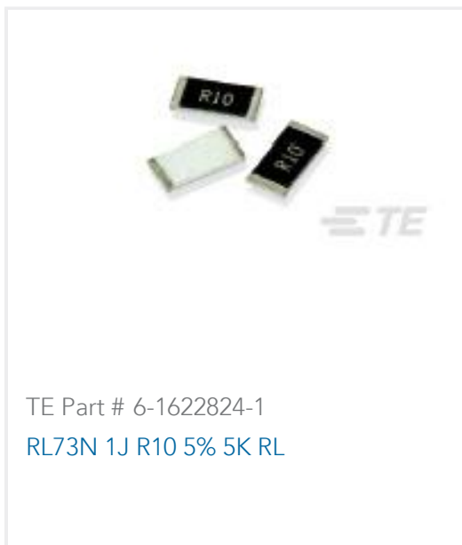
TE Part # 6-1622824-1 RL73N 1J R10 5% 5K RL