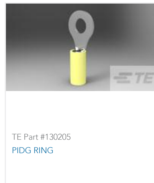
TE Part #130205 PIDG RING