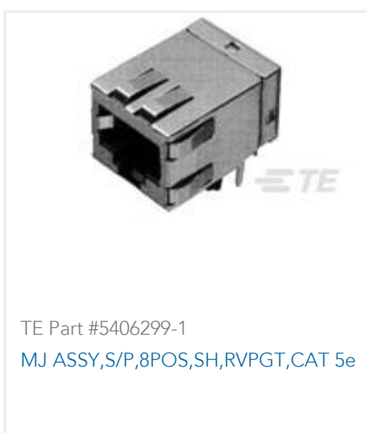
TE Part #5406299-1 MJ ASSY,S/P,8POS,SH,RVPGT,CAT 5e