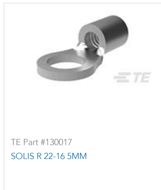
TE Part #130017 SOLIS R 22-16 5MM