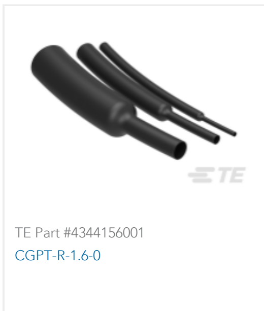
TE Part #4344156001 CGPT-R-1.6-0