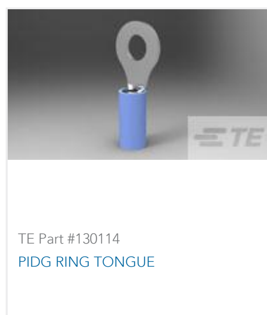
TE Part #130114 PIDG RING TONGUE