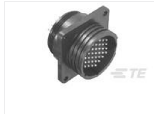
TE Part #213780-1 CPC RECPT ASSEMBLY SIZE 23-24