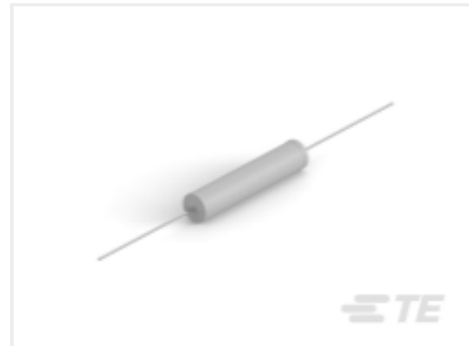
TE Part #1-2176415-8 8W STD M/OX 5% 150R