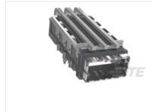
TE Part #2149159-3 CXP RCPT KIT W/LIGHT PIPE & HEAT SINK