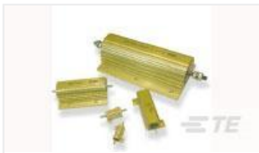
TE Part #5-1630019-4 HSC200 560R 5%