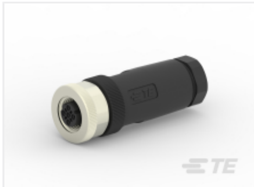
TE Part #T4110502021-000 M12,FEMALE,STRAIGHT,D CODE,2P, PG9,GOLD