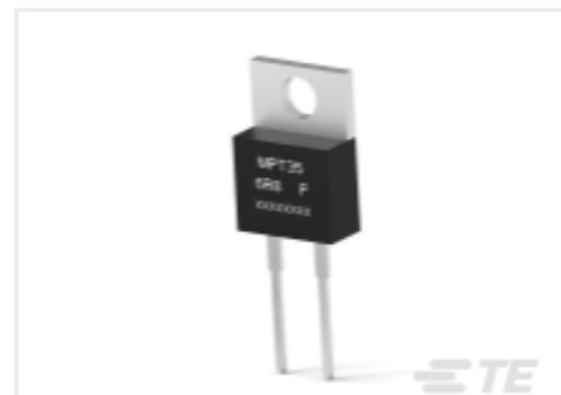
TE Part #5-2176430-5 MPT35 82R 1%