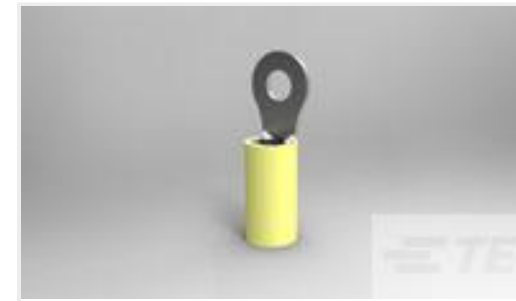
TE Part #320568 TERMINAL,PIDG R 12-10 8