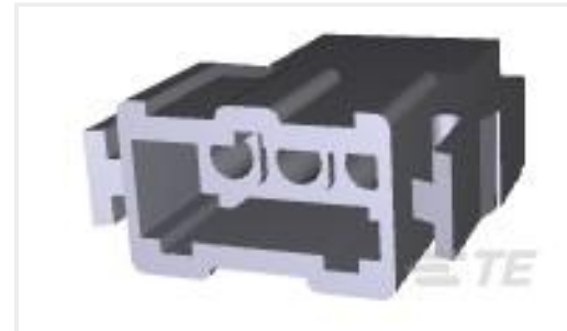
TE Part #207359-1 RECEPT HSG,3 POSN,METRIC