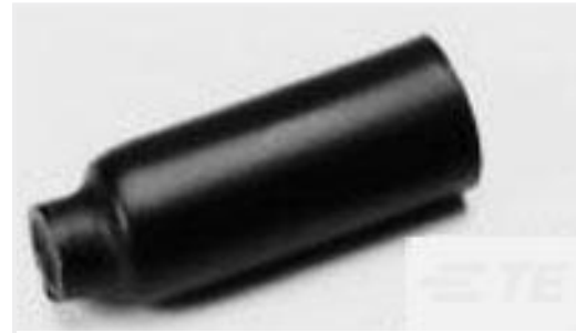
TE Part #5510320002 PD-CAP-1/8-0