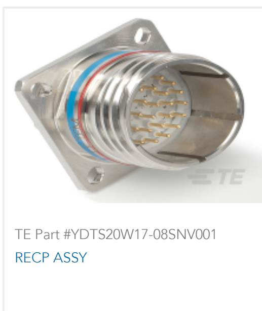
TE Part #YDTS20W17-08SNV001 RECP ASSY