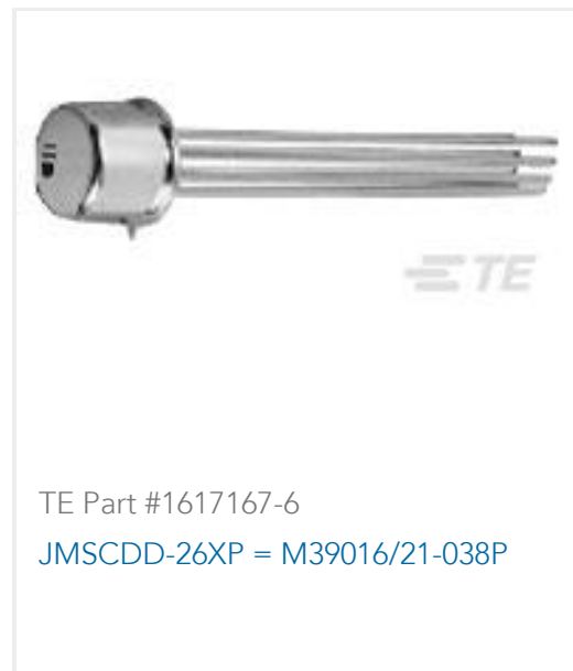
TE Part #1617167-6 JM5CDD-26XP = M39016/21-038P