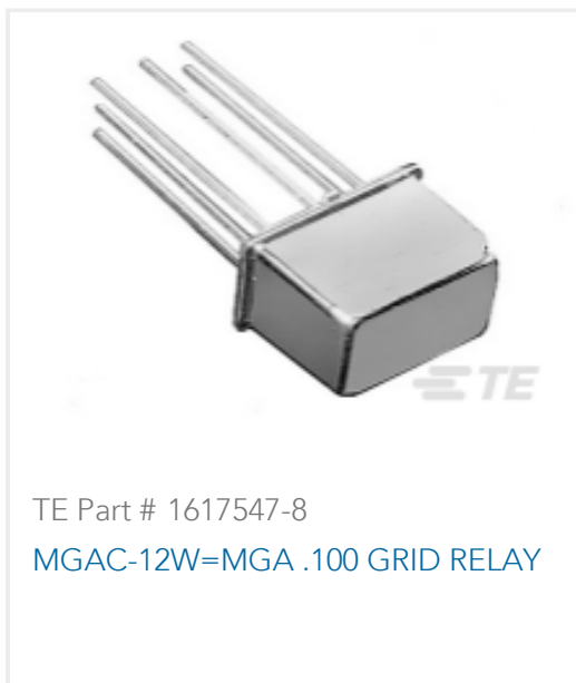
TE Part # 1617547-8 MGAC-12W=MGA .100 GRID RELAY