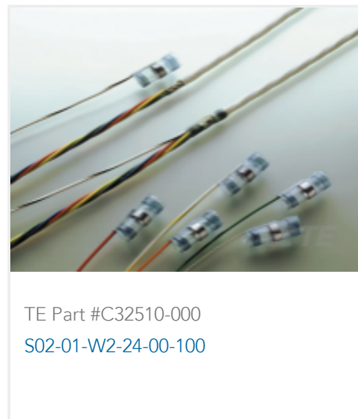
TE Part #C32510-000 S02-01-W2-24-00-100