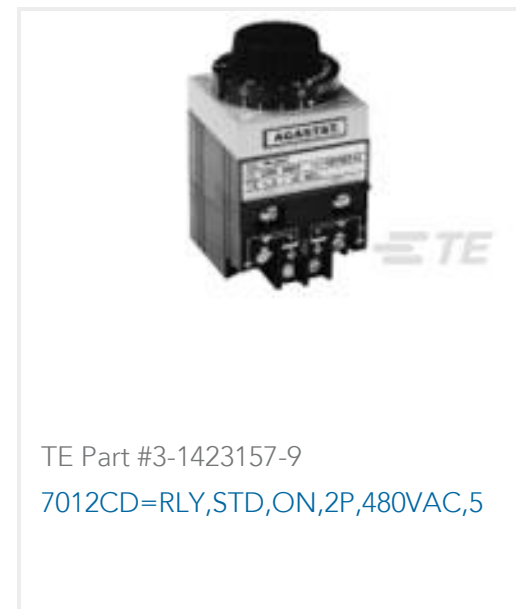
TE Part #3-1423157-9 7012CD=RLY,STD,ON,2P,480VAC,5