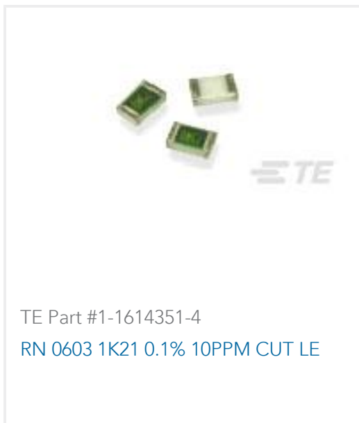
TE Part #1-1614351-4 RN 0603 1K21 0.1% 10PPM CUT LE