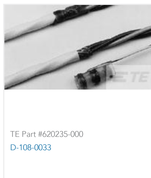
TE Part #620235-000 D-108-0033