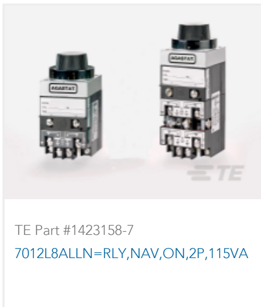
TE Part #1423158-7 7012L8ALLN=RLY,NAV,ON,2P,115VA