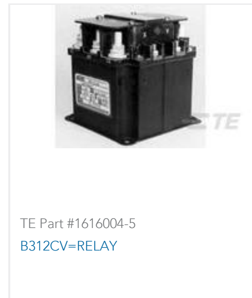
TE Part #1616004-5 B312CV=RELAY