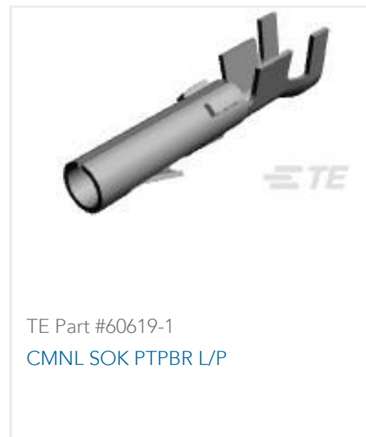
TE Part #60619-1 CMNL SOK PTPBR L/P