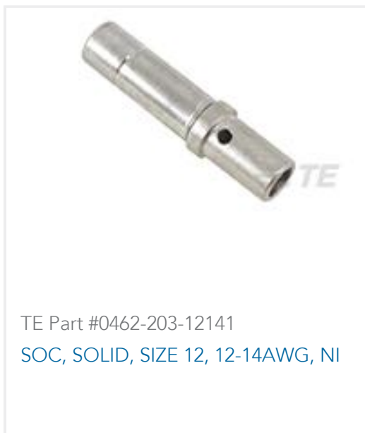
TE Part #0462-203-12141 SOC, SOLID, SIZE 12, 12-14AWG, NI