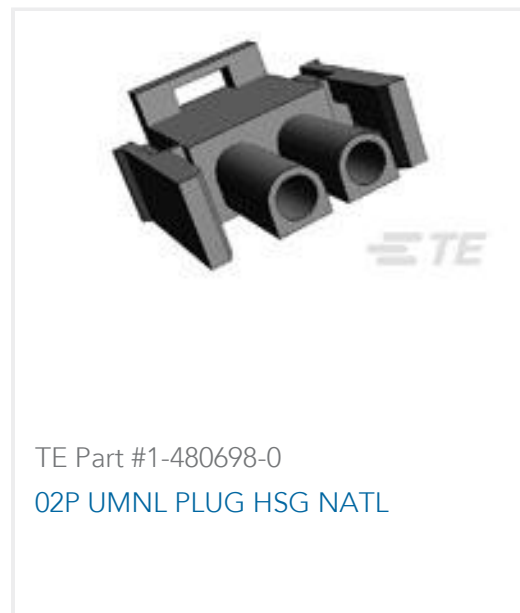
TE Part #1-480698-0 02P UMNL PLUG HSG NATL