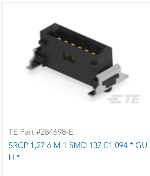
TE Part #284698-E SRCP 1,27 6 M 1 SMD 137 E1 094 * GU-H*