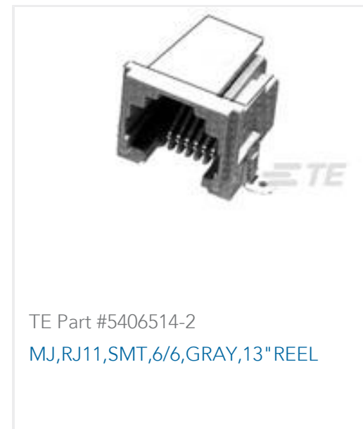
TE Part #5406514-2 MJ,RJ11,SMT,6/6,GRAY,13" REEL