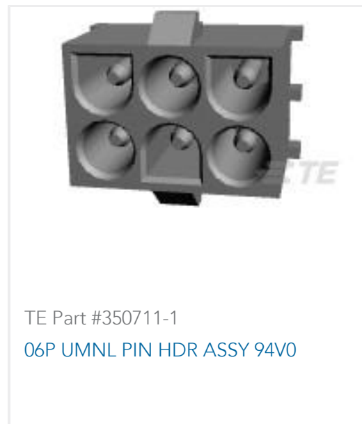
TE Part #350711-1 06P UMNL PIN HDR ASSY 94VO