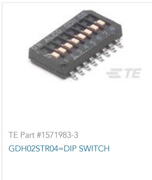
TE Part #1571983-3 GDH02STR04=DIP SWITCH