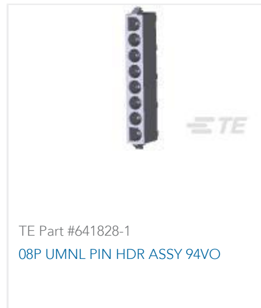
TE Part #641828-1 08P UMNL PIN HDR ASSY 94VO