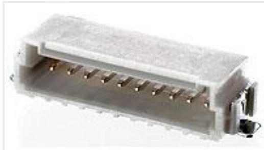
TE Part #1-292228-6 1.5 MINI CT SGL H SMT W/O BOSS