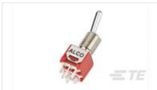
TE Part #2267077-1 TMS1T4B5M2RE