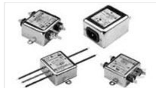
TE Part #1-6609027-5 10EK7=F7095 S0