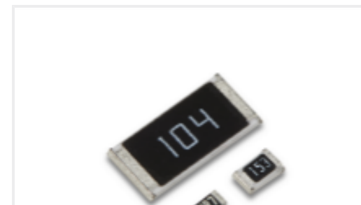
TE Part #2176347-6 CRGCQ 2010 27R 1%