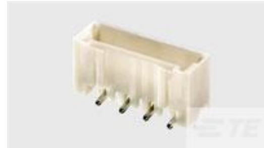
TE Part #292231-3 1.5 MINI CT SGL V SMT W/O BOSS