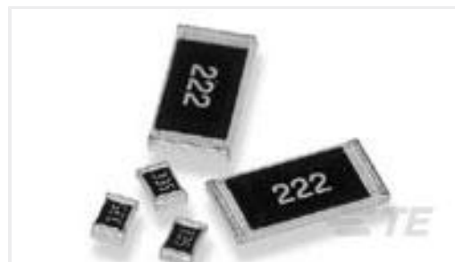
TE Part #4-1879499-9 CRGH2010 5% 100R 1W