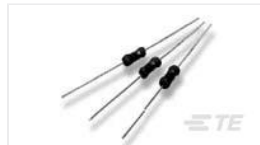
TE Part #9-1879352-1 RR02 5% 1K8 AMMO