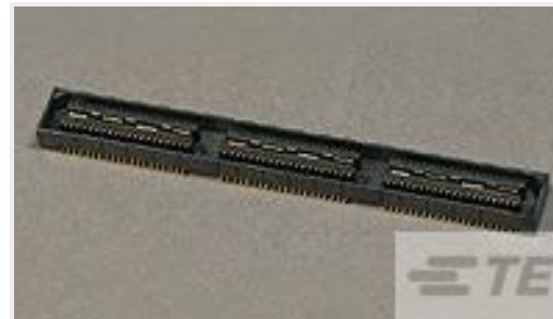
TE Part #2-1658012-3 MSB0.80RC-ASY120FL,-,10,-TY