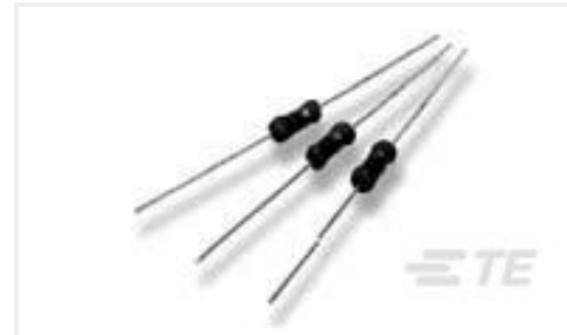
TE Part #9-1879352-1 RR02 5% 1K8 AMMO