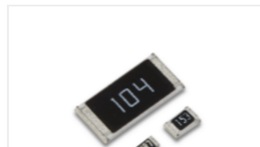
TE Part #2176347-6 CRGCQ 2010 27R 1%