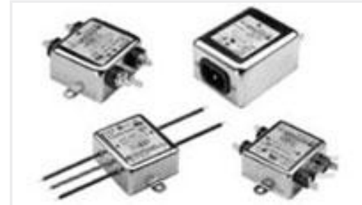
TE Part #1-6609027-5 10EK7=F7095 S0