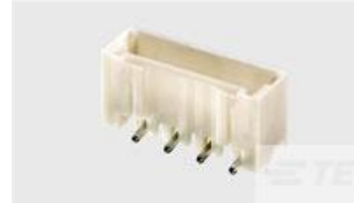
TE Part #292231-3 1.5 MINI CT SGL V SMT W/O BOSS