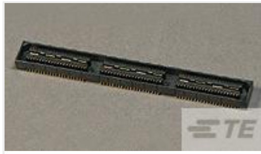
TE Part #2-1658012-3 MSB0.80RC-ASY120FL,-,10,-TY