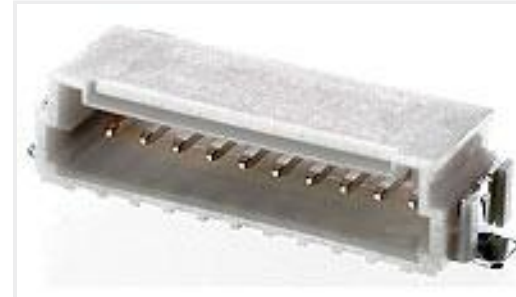
TE Part #1-292228-6 1.5 MINI CT SGL H SMT W/O BOSS