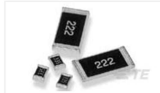
TE Part #4-1879499-9 CRGH2010 5% 100R 1W