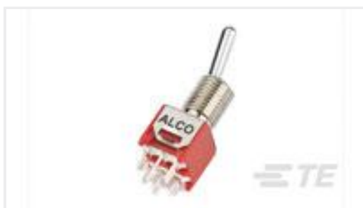
TE Part #2267077-1 TMS1T4B5M2RE