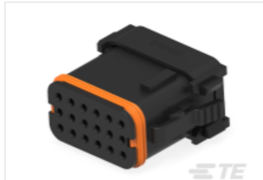
TE Part #DT16-18SA-K004 PLG, 18P, BLK, E, A