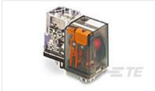
TE Part #5-1393104-1 KRPA-11DN-24=KRPA