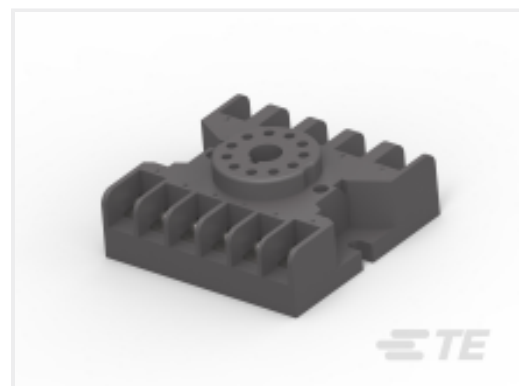
TE Part #1393143-7 27E123=SOCKET,KRP,11,SCW,PLE