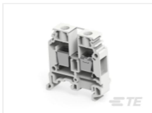
TE Part #1SNA115120R1700 M10/10