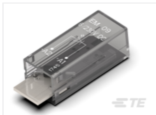
TE Part #9-1415036-1 PTMT00A0