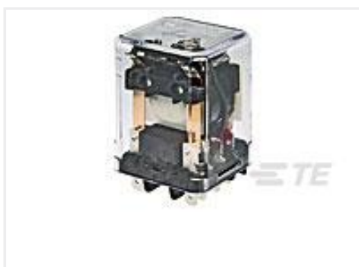
TE Part #1393114-9 KUEP-7D15-110=KU