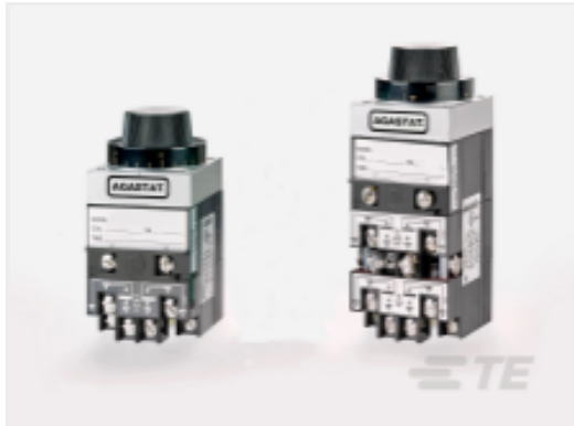
TE Part # 1423162-5 7022AC=RLY,STD,OFF,2P 120VAC,1