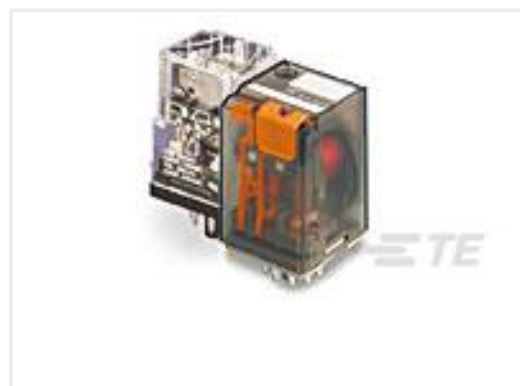
TE Part #6-1393104-5 KRPA-14AG-120=KRPA