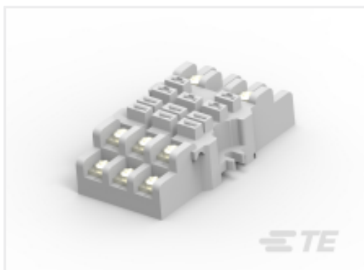
TE Part #1393143-5 27E121=SOCKET,KUP,11,SCW,PLE