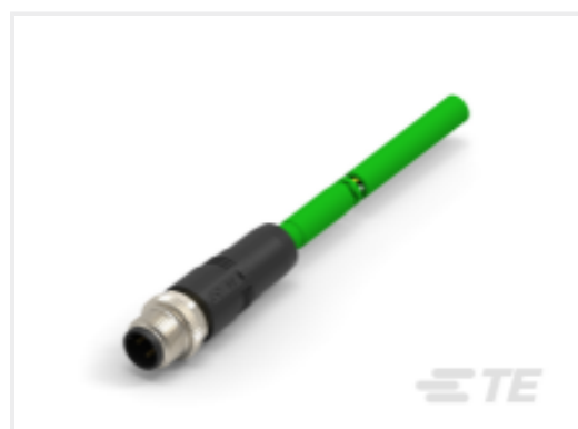
TE Part #TAD14141111-020 M12D4-MS-PVC TYPE B-2.0M