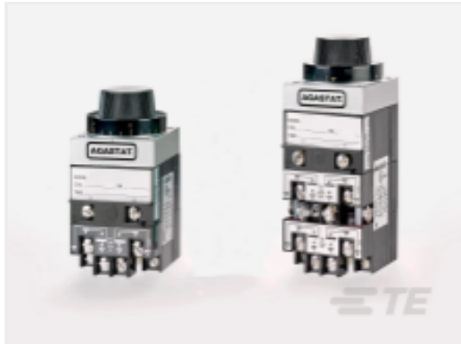
TE Part # 1423162-5 7022AC=RLY,STD,OFF,2P 120VAC,1