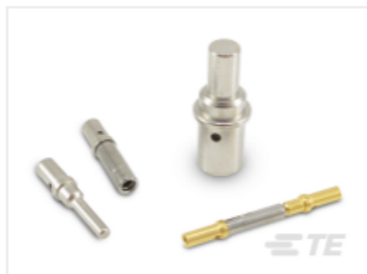
TE Part #CAT-D48-ST273 DEUTSCH Connector Solid Contacts