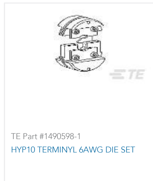
TE Part #1490598-1 HYP10 TERMINYL 6AWG DIE SET