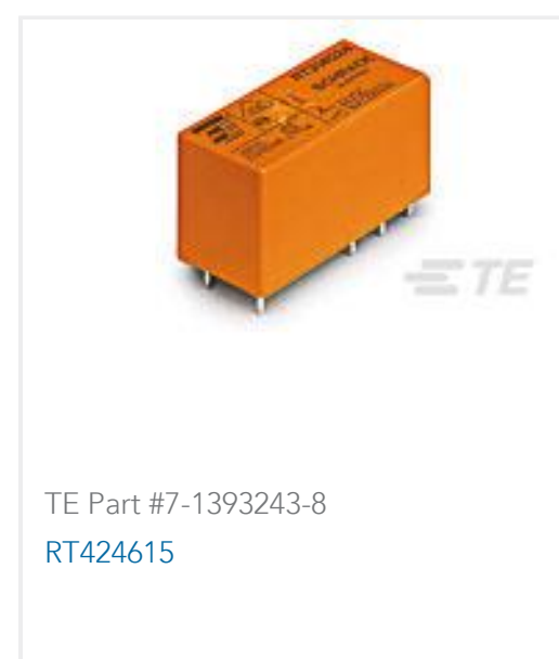
TE Part #7-1393243-8 RT424615