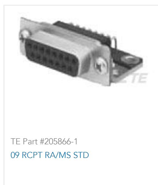
TE Part #205866-1 09 RCPT RA/MS STD