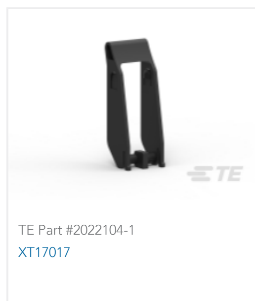
TE Part #2022104-1 XT17017