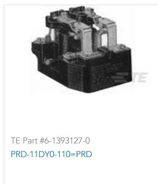
TE Part #6-1393127-0 PRD-11DY0-110=PRD