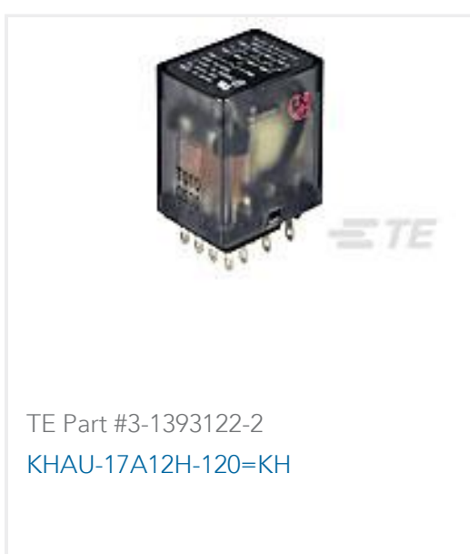
TE Part #3-1393122-2 KHAU-17A12H-120=KH