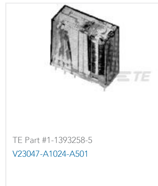
TE Part #1-1393258-5 V23047-A1024-A501