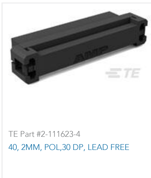
TE Part #2-111623-4 40, 2MM, POL,30 DP, LEAD FREE