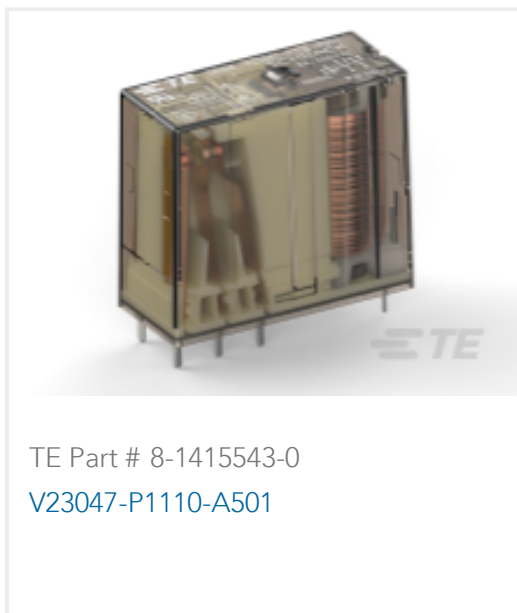
TE Part # 8-1415543-0 V23047-P1110-A501