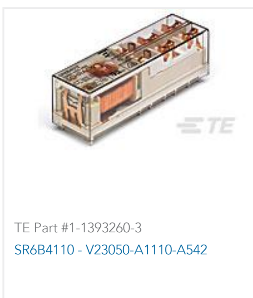
TE Part #1-1393260-3 SR6B4110 - V23050-A1110-A542