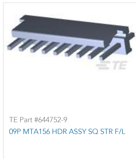
TE Part #644752-9 09P MTA156 HDR ASSY SQ STR F/L