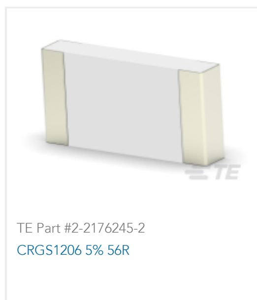
TE Part #2-2176245-2 CRGS1206 5% 56R