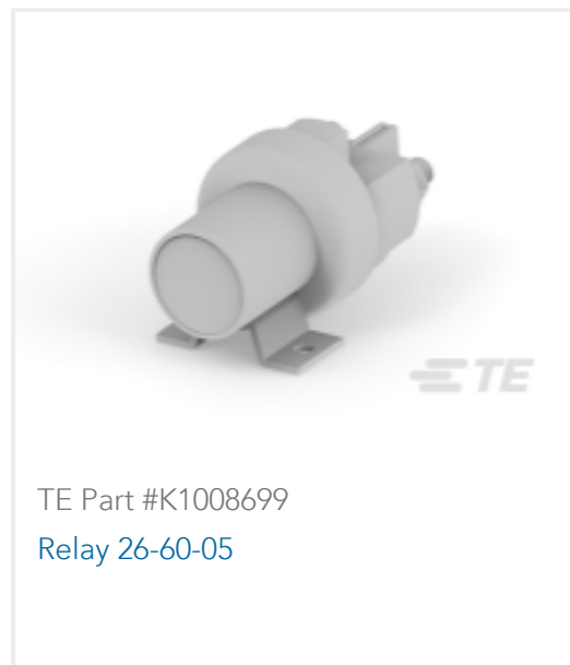
TE Part #K1008699 Relay 26-60-05