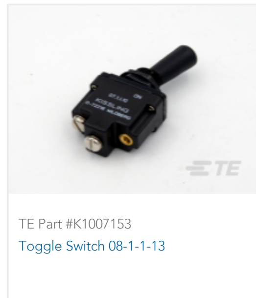
TE Part #K1007153 Toggle Switch 08-1-1-13