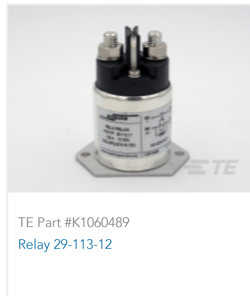
TE Part #K1060489 Relay 29-113-12