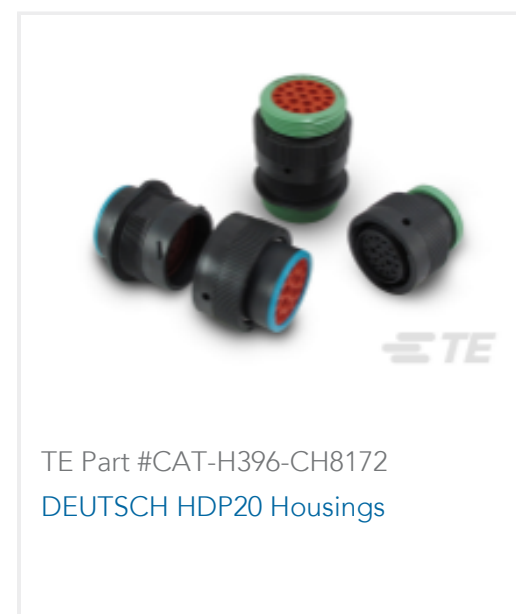
TE Part #CAT-H396-CH8172 DEUTSCH HDP20 Housings