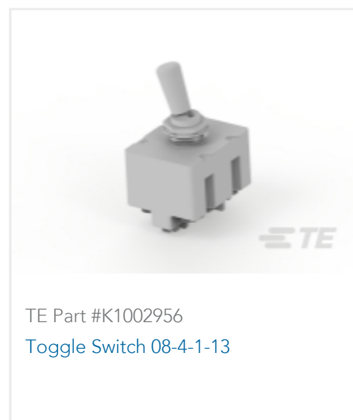
TE Part #K1002956 Toggle Switch 08-4-1-13