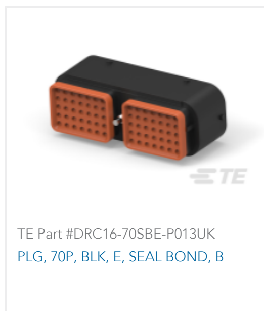
TE Part #DRC16-70SBE-P013UK PLG, 70P, BLK, E, SEAL BOND, B