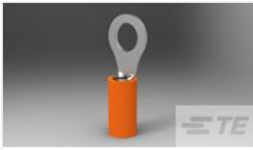
TE Part #152881 18-16 PIDG RT NO 10STUD ORANGE