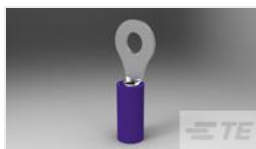
TE Part #152895 20 PIDG RT NO 6 STUD PURPL