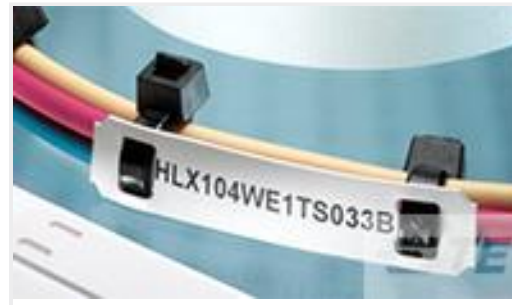
TE Part #EC7637-000 HLX104YW1TS050B