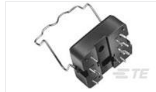
TE Part #1393824-1 V23154Z1001