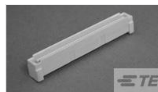
TE Part #6123001-6 0.8FH,P08H.5,140,30/Sn,TR,SC