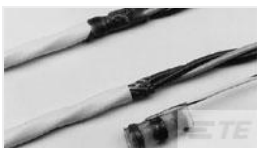
TE Part #621056-000 D-142-52