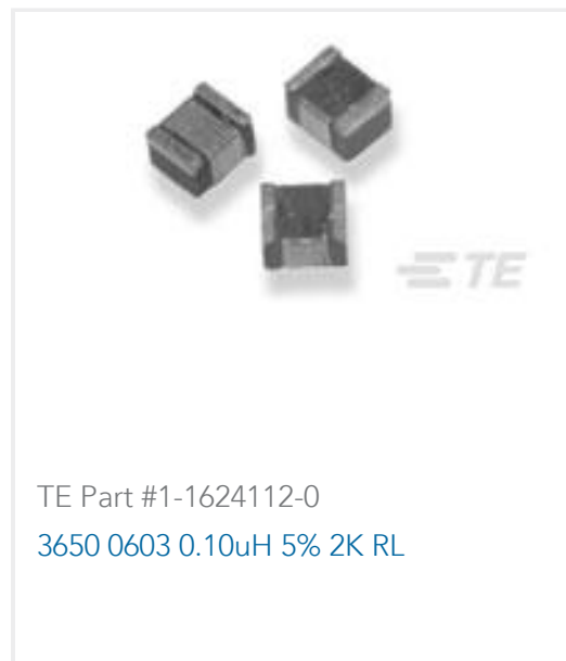
TE Part #1-1624112-0 3650 0603 0.10uH 5% 2K RL