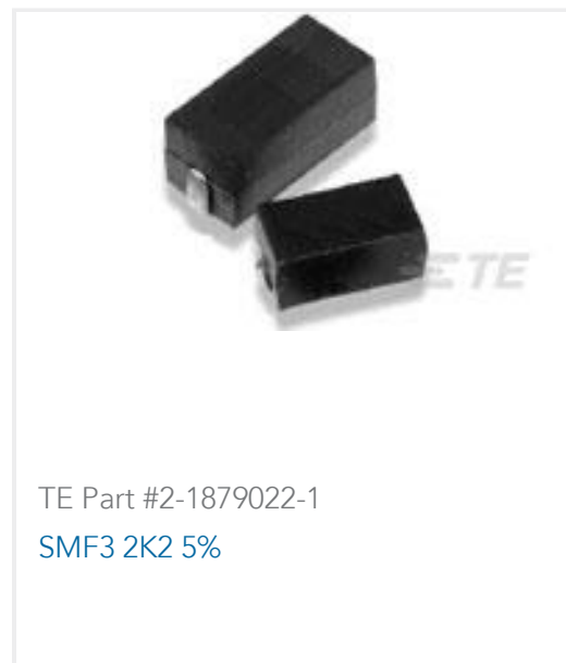
TE Part #2-1879022-1 SMF3 2K2 5%