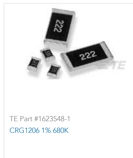
TE Part #1623548-1 CRG1206 1% 680K