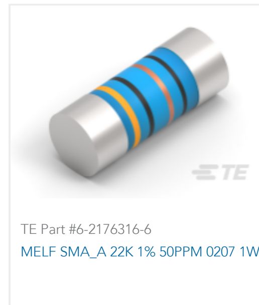
TE Part #6-2176316-6 MELF SMA_A 22K 1% 50PPM 0207 1W