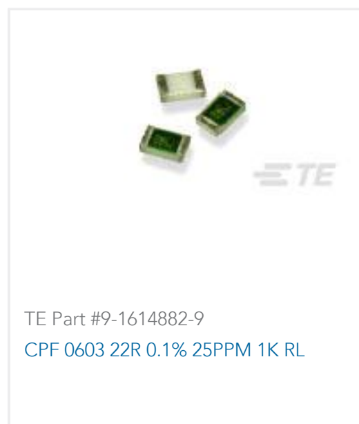
TE Part #9-1614882-9 CPF 0603 22R 0.1% 25PPM 1K RL