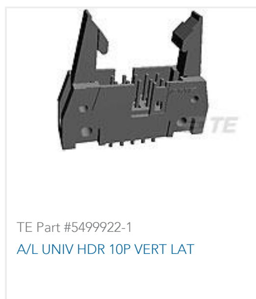
TE Part #5499922-1 A/L UNIV HDR 10P VERT LAT