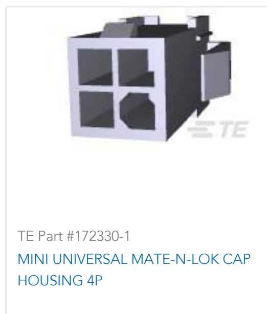
TE Part #172330-1 MINI UNIVERSAL MATE-N-LOK CAP HOUSING 4P