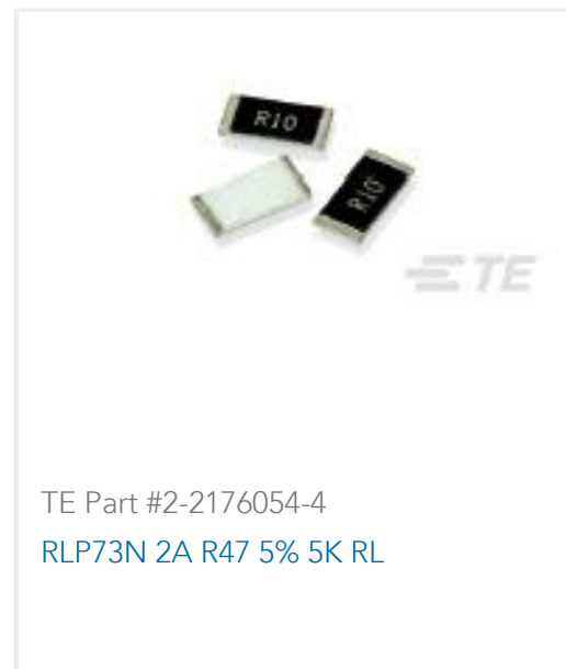
TE Part #2-2176054-4 RLP73N 2A R47 5% 5K RL