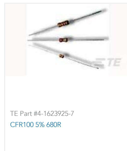
TE Part #4-1623925-7 CFR100 5% 680R