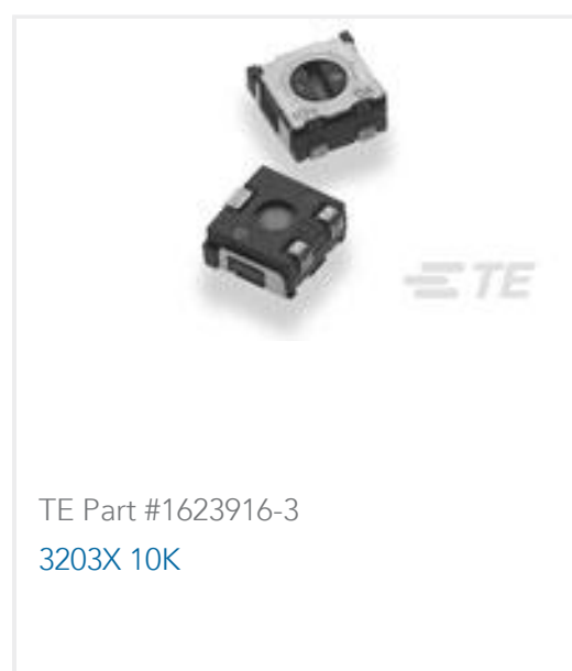
TE Part #1623916-3 3203X 10K