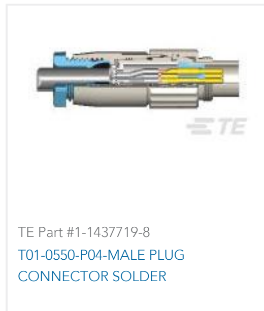
TE Part #1-1437719-8 T01-0550-P04-MALE PLUG CONNECTOR SOLDER