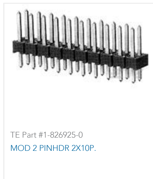
TE Part #1-826925-0 MOD 2 PINHDR 2X10P.