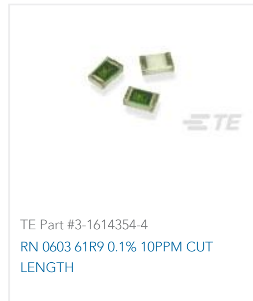
TE Part #3-1614354-4 RN 0603 61R9 0.1% 10PPM CUT LENGTH