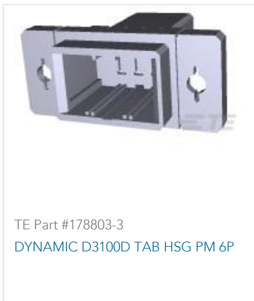
TE Part #178803-3 DYNAMIC D3100D TAB HSG PM 6P