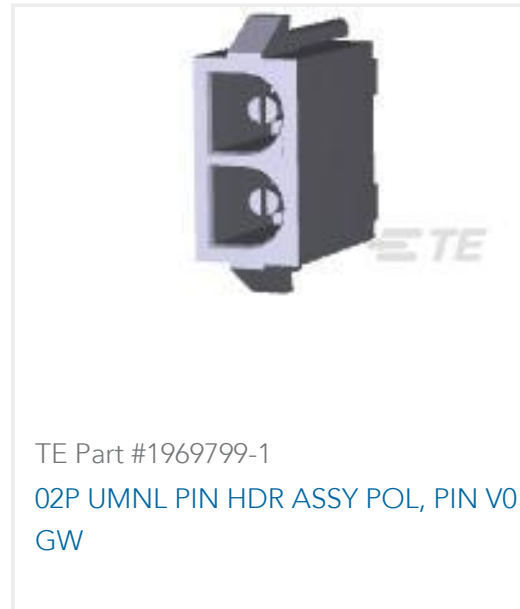
TE Part #1969799-1 02P UMNL PIN HDR ASSY POL, PIN V0 GW