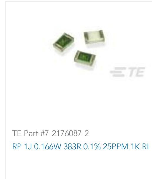
TE Part #7-2176087-2 RP 1J 0.166W 383R 0.1% 25PPM 1K RL