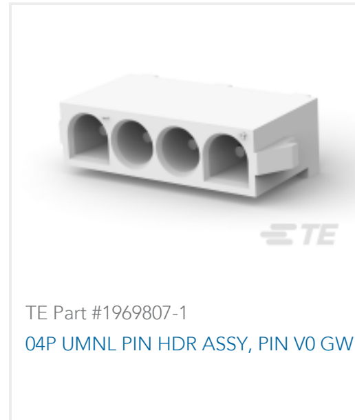
TE Part #1969807-1 04P UMNL PIN HDR ASSY, PIN V0 GW