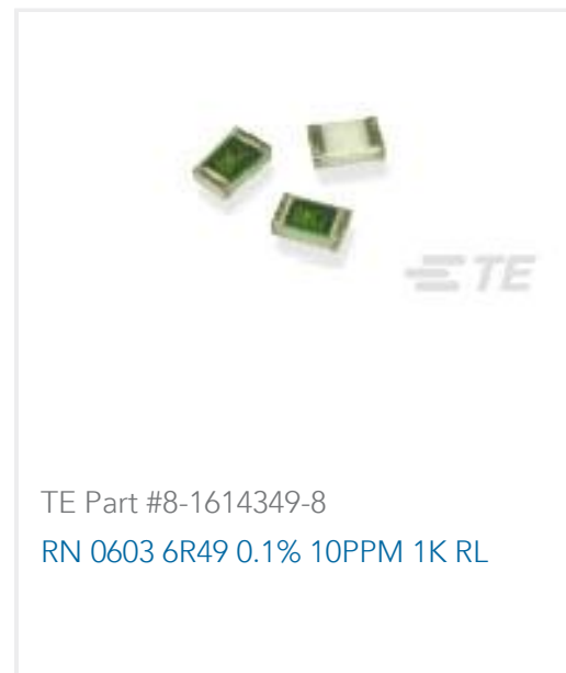
TE Part #8-1614349-8 RN 0603 6R49 0.1% 10PPM 1K RL