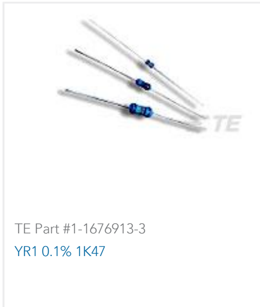
TE Part #1-1676913-3 YR1 0.1% 1K47