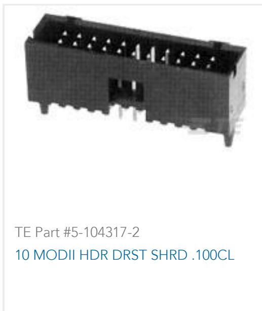
TE Part #5-104317-2 10 MODII HDR DRST SHRD .100CL