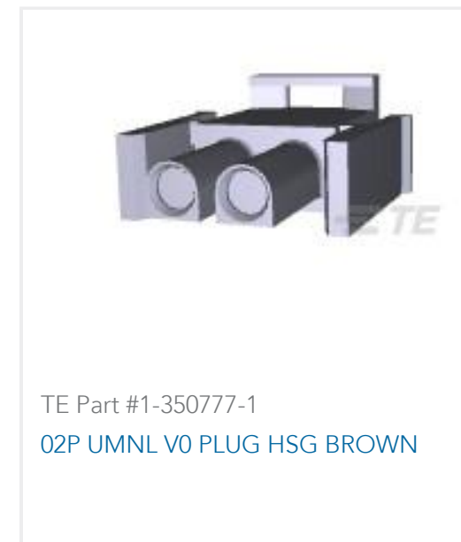
TE Part #1-350777-1 02P UMNL V0 PLUG HSG BROWN