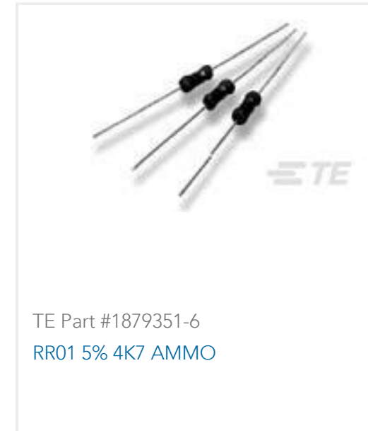
TE Part #1879351-6 RR01 5% 4K7 AMMO