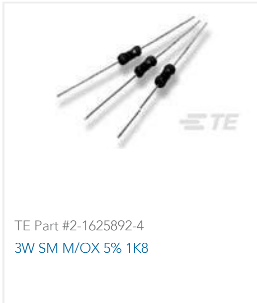
TE Part #2-1625892-4 3W SM M/OX 5% 1K8