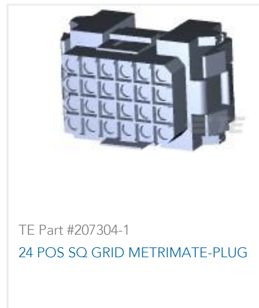
TE Part #207304-1 24 POS SQ GRID METRIMATE-PLUG