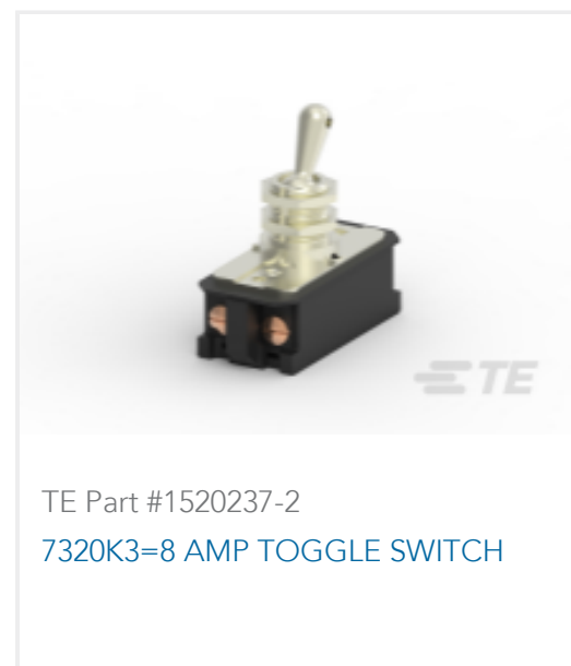
TE Part #1520237-2 7320K3=8 AMP TOGGLE SWITCH