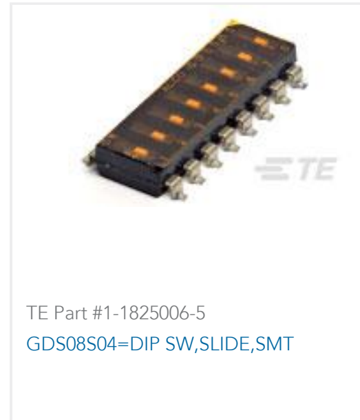
TE Part #1-1825006-5 GDS08S04=DIP SW,SLIDE,SMT