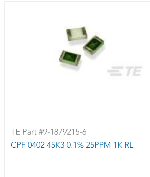
TE Part #9-1879215-6 CPF 0402 45K3 0.1% 25PPM 1K RL