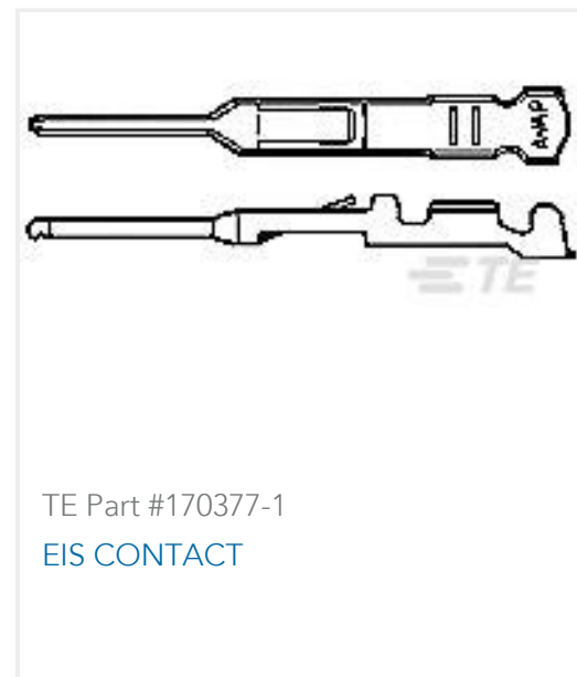
TE Part #170377-1 EIS CONTACT