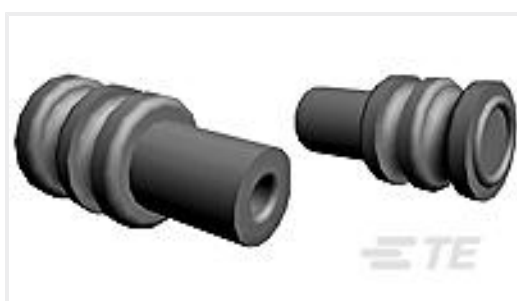
TE Part #964972-1 EINZELLEITERDICHTUNG