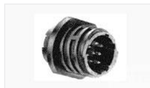
TE Part #206838-4 CPC RECPT SEALED SIZE 23-24