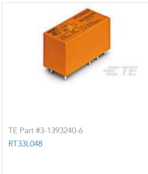
TE Part #3-1393240-6 RT33L048