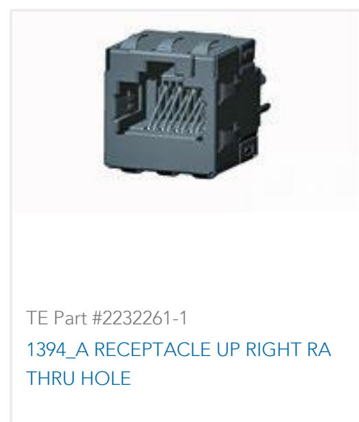
TE Part #2232261-1 1394_A RECEPTACLE UP RIGHT RA THRU HOLE