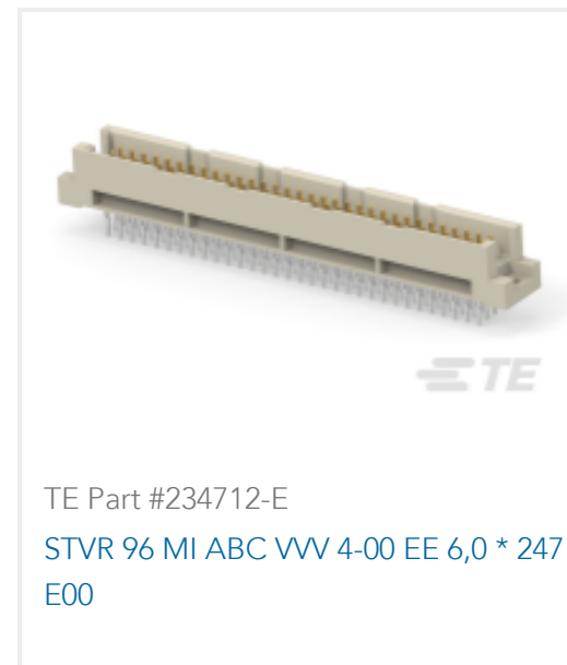
TE Part #234712-E STVR 96 MI ABC VVV 4-00 EE 6,0 * 247 E00