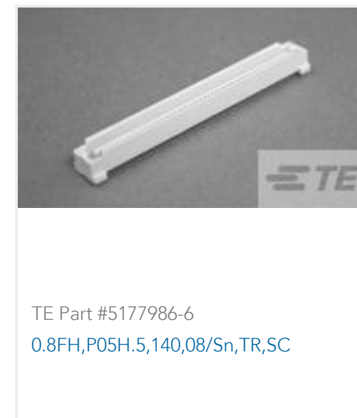
TE Part #5177986-6 0.8FH,P05H.5,140,08/Sn,TR,SC