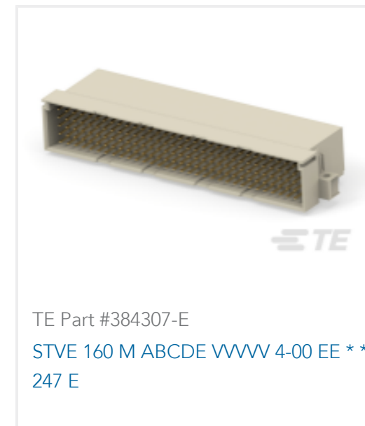
TE Part #384307-E STVE 160 M ABCDE VVVV 4-00 EE * * 247 E