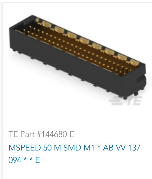
TE Part #144680-E MSPEED 50 M SMD M1 * AB VV 137 094 * * E