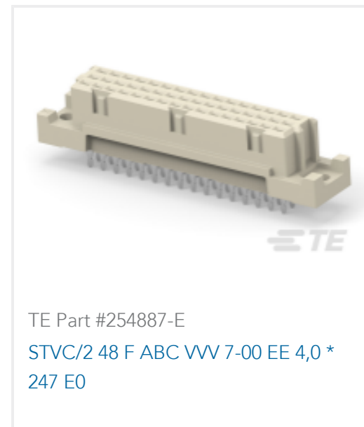
TE Part #254887-E STVC/2 48 F ABC VVV 7-00 EE 4,0 * 247 E0