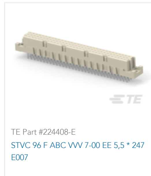
TE Part #224408-E STVC 96 F ABC VVV 7-00 EE 5,5 * 247 E007