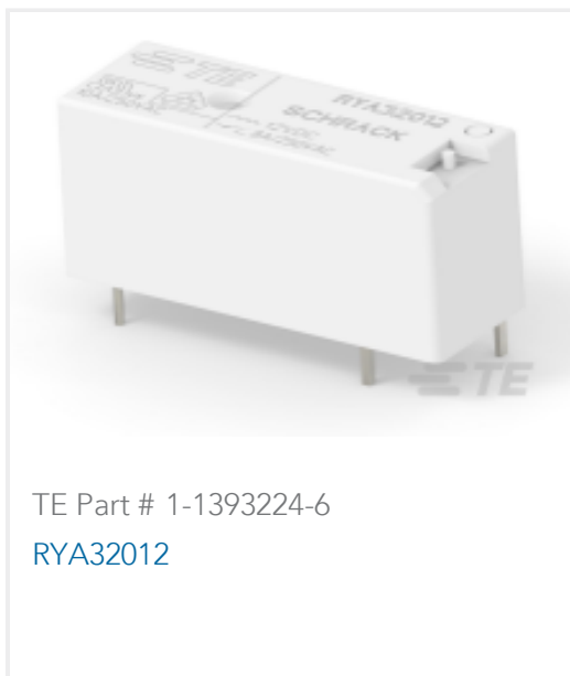
TE Part # 1-1393224-6 RYA32012