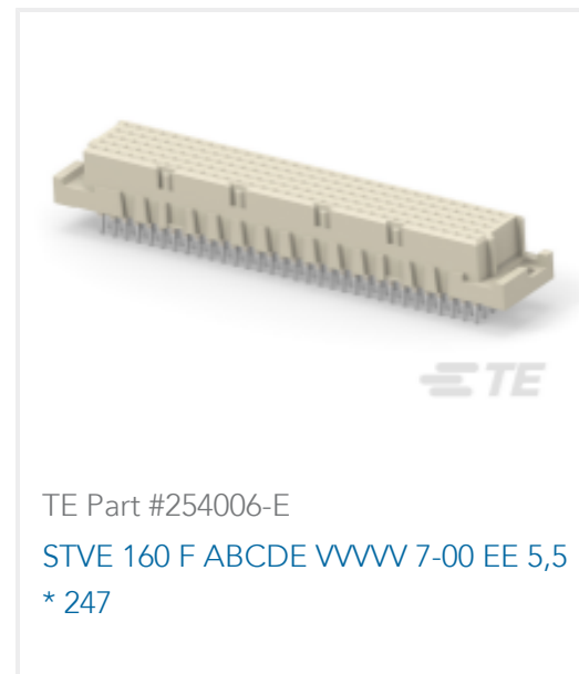
TE Part #254006-E STVE 160 F ABCDE VVVV 7-00 EE 5,5 * 247