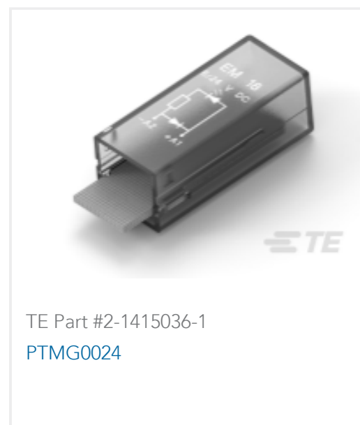
TE Part #2-1415036-1 PTMG0024