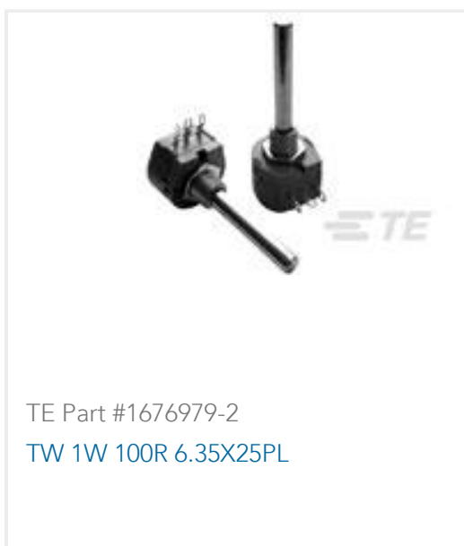
TE Part #1676979-2 TW 1W 100R 6.35X25PL