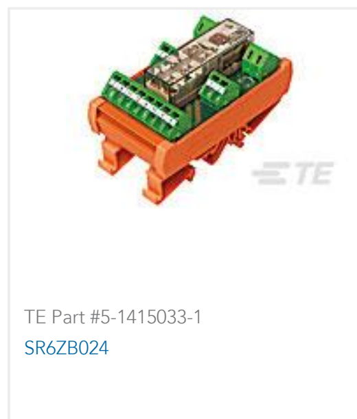
TE Part #5-1415033-1 SR6ZB024