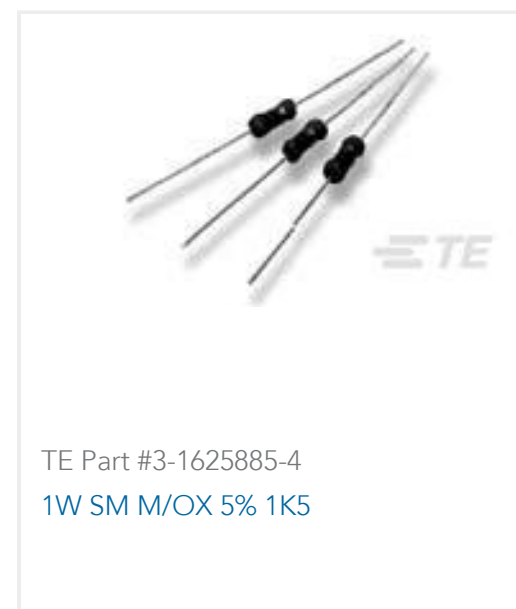
TE Part #3-1625885-4 1W SM M/OX 5% 1K5