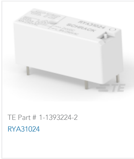
TE Part # 1-1393224-2 RYA31024