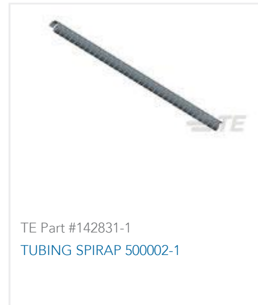
TE Part #142831-1 TUBING SPIRAP 500002-1