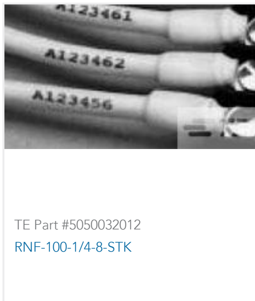
TE Part #5050032012 RNF-100-1/4-8-STK