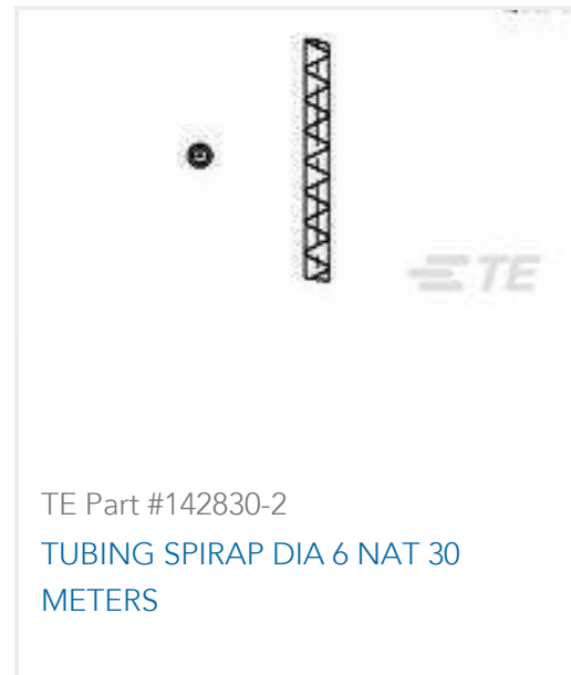
TE Part #142830-2 TUBING SPIRAP DIA 6 NAT 30 METERS