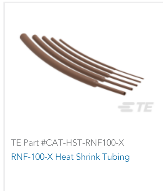
TE Part #CAT-HST-RNF100-X RNF-100-X Heat Shrink Tubing