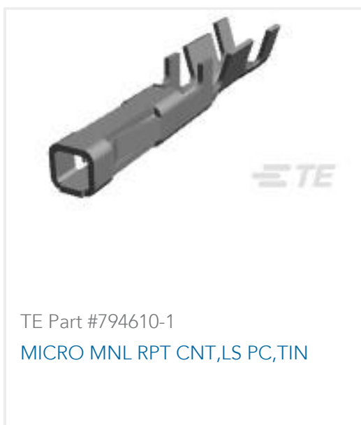
TE Part #794610-1 MICRO MNL RPT CNT,LS PC,TIN