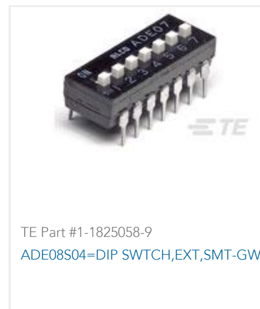
TE Part #1-1825058-9 ADE08S04=DIP SWITCH,EXT,SMT-GW