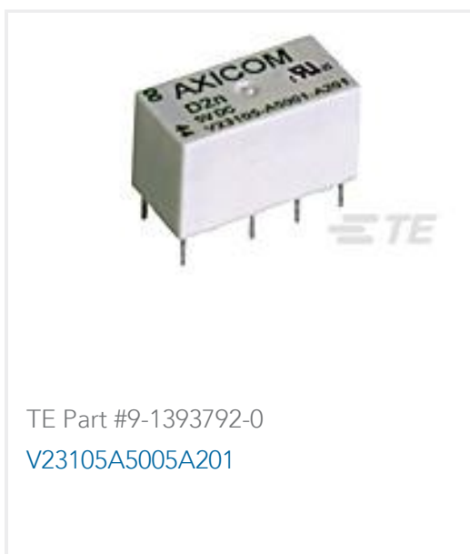
TE Part #9-1393792-0 V23105A5005A201