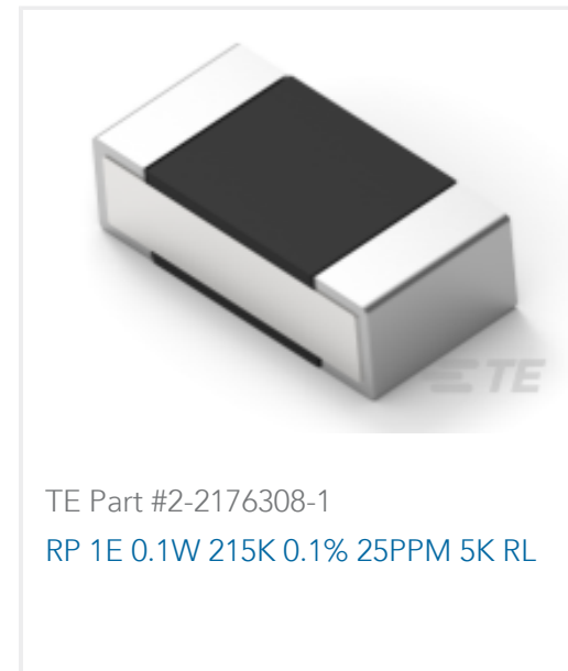
TE Part #2-2176308-1 RP 1E 0.1W 215K 0.1% 25PPM 5K RL