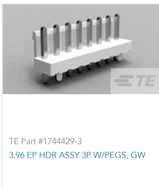
TE Part #1744429-3 3.9% EP HDR ASSY 3P W/PEGS, GW