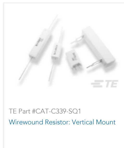
TE Part #CAT-C339-SQ1 Wirewound Resistor: Vertical Mount