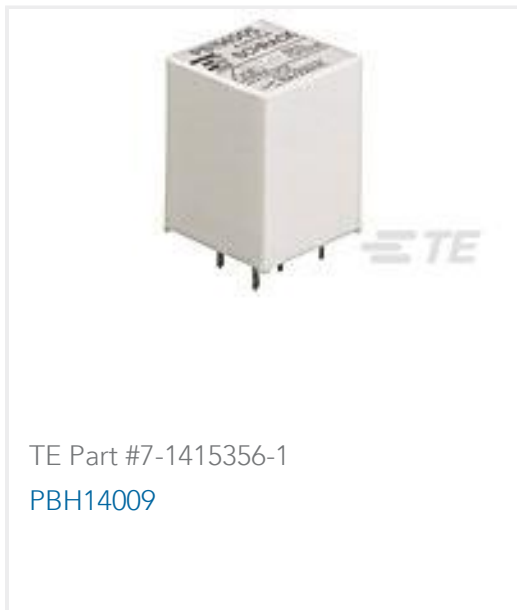
TE Part #7-1415356-1 PBH14009