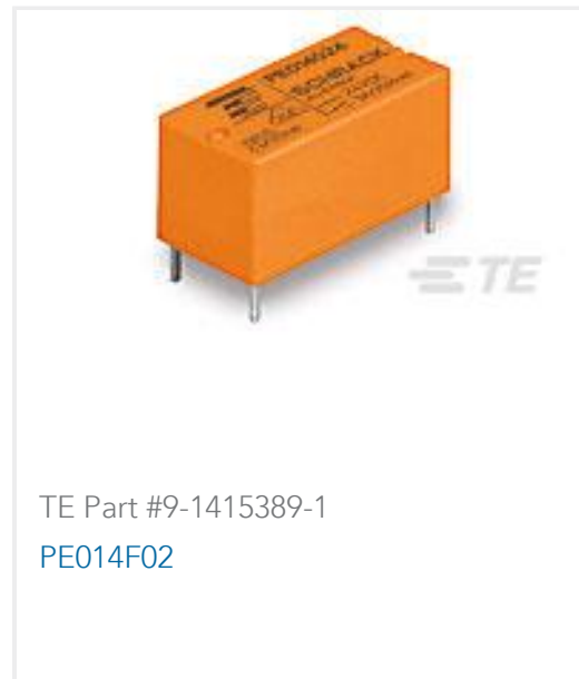
TE Part #9-1415389-1 PE014F02