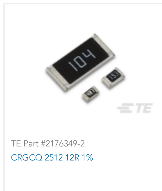
TE Part #2176349-2 CRGCQ 2512 12R 1%