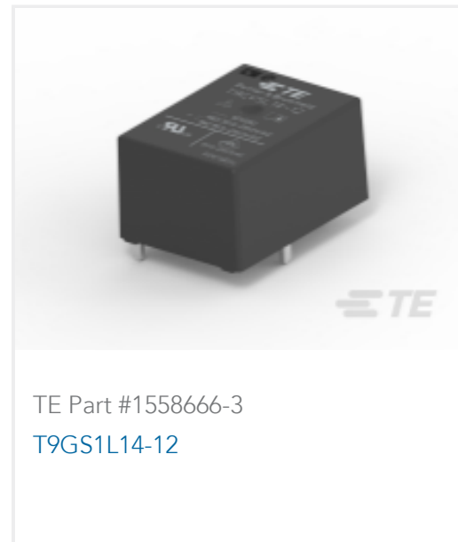
TE Part #1558666-3 T9GS1L14-12