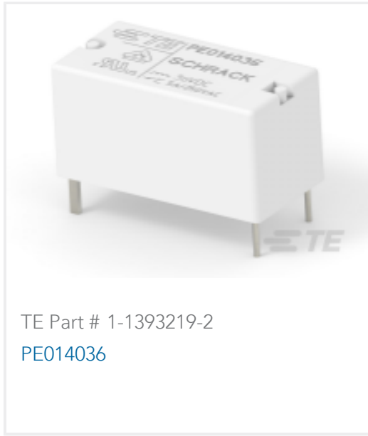
TE Part # 1-1393219-2 PE014036