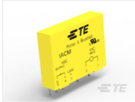
TE Part # 9-1393028-0 IACM-24E =SLIM PCB MONT,24VDC Logi-AC ip