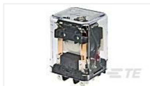
TE Part #1393114-9 KUEP-7D15-110=KU