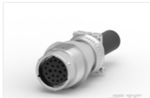
TE Part #HD34-18-20SN-059 REC,20P,AL,N,CBLCLMP BT,DRAIN,16 /20,S,MC