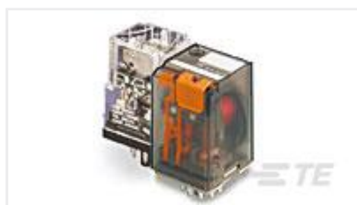
TE Part #3-1393104-6 KRPA-11AY-120=KRPA