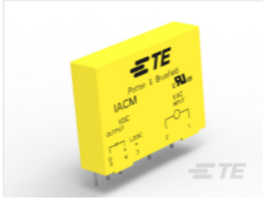
TE Part # 8-1393028-3 IACM-15E =SLIM PCB MONT,15VDC Logi-AC ip