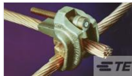
TE Part #83749-2 WRENCH-LOK 3/0-3/0, 300-#2