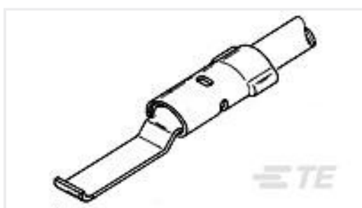
TE Part #151471 12-10 PIDG LIP'D BLADE 6.45-