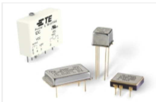
Solid State Relays(2)