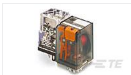
TE Part #3-1393104-8 KRPA-11AY-240=KRPA