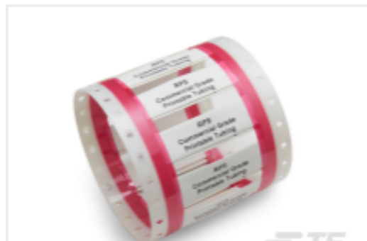
TE Part #CAT-T3437-R819 RPS Commercial Grade Sleeves