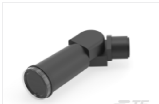
TE Part #908604-000 ALR-TL-115