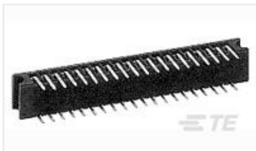
TE Part # 532956-7 40 MODII 2PC CE RCPT ASSY