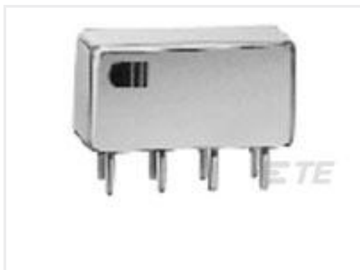
TE Part #2-1617033-8 HFW1230K00 = HFW 1/2 SIZE RELA