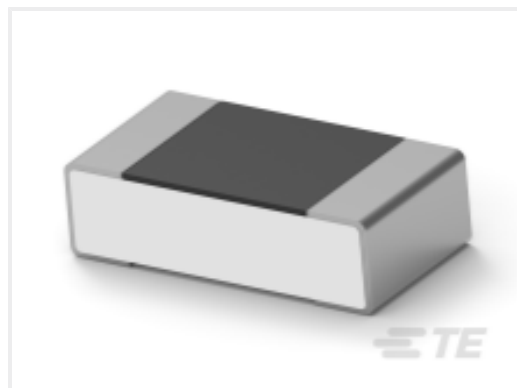
TE Part #3-2176371-2 RQ 0603 9K76 0.1% 10PPM 5K RL