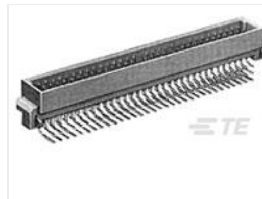
TE Part #650907-5 150 EURO TYPE C PIN ST ASSY