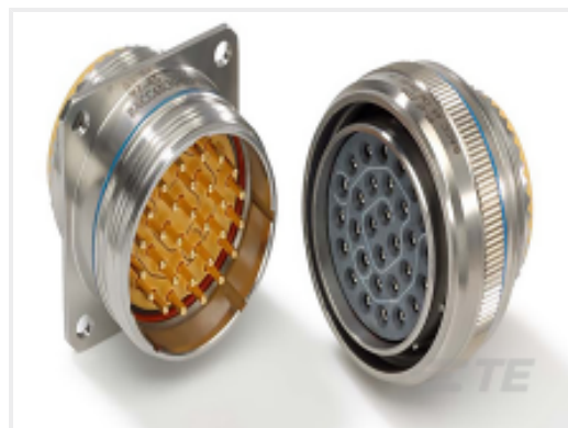
TE Part #ZPF000000000009134 983-7SE 08-03 PN-A246