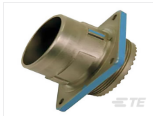
TE Part #YDIV40E21-11PNC003 RECP ASSY