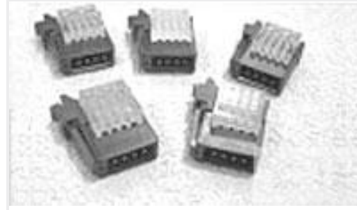
TE Part #2-1473562-4 RITS CONN. PLUG ASSY 4P BLUE