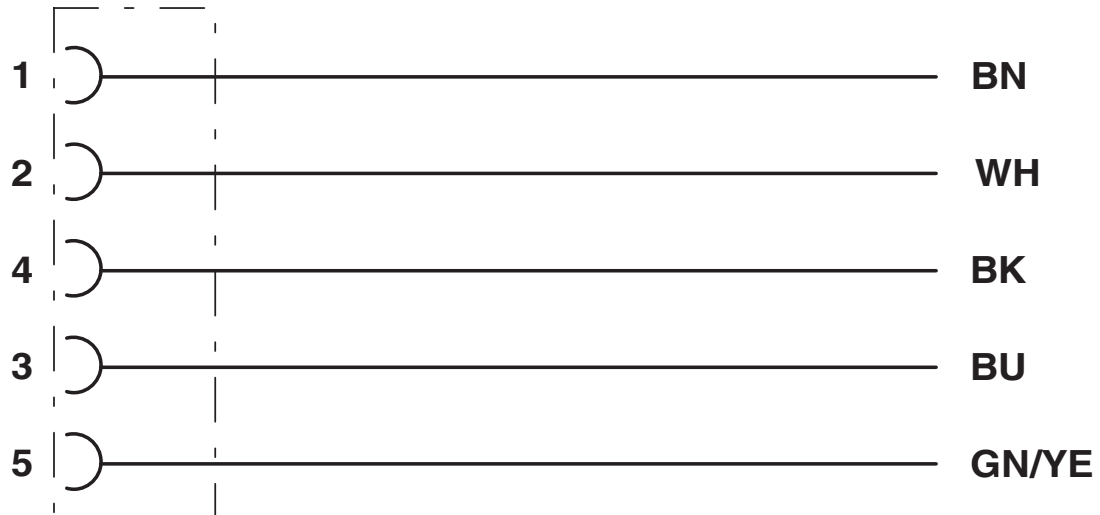
Contact assignment of the M12 sockets