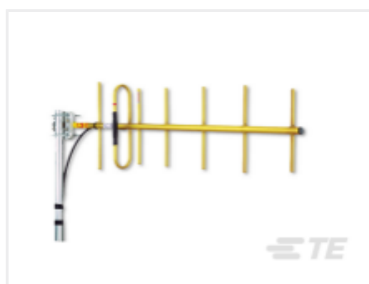
TE Part #YF450112-61NF YAGI,FWG,7,450-490MHZ TB,12, FOLDED YAGI