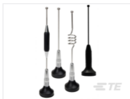
TE Part #A8963-L WHIP,AB,OC,896-970MHz 933,3,CH, GP,