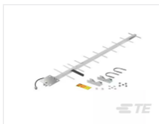
TE Part #PC8910N Yagi,FWA,12in,NF 896-940MHz,11dBd