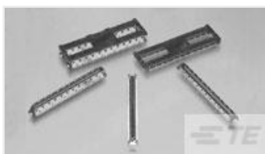
TE Part #3-5353652-6 .5FHP08H,440,B,GIG,08/Sn,HT,NSYes