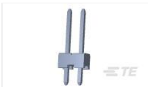
TE Part #3-644456-2 02P MTA100 HDR ASSY (NARROW)