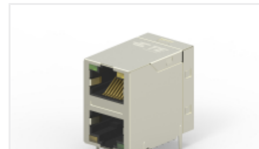
TE Part #2301997-7 RJ45 JACK INT.MAG. 1GB LED 2X1