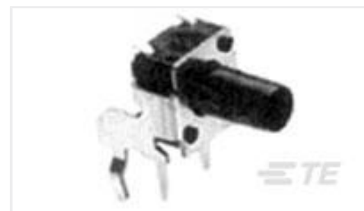
TE Part #1825027-2 FSMRA1JH04=R/A, TACT PB SW, 160G