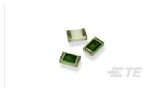
TE Part #9-1879212-8 CPF 0402 24R9 0.1% 25PPM 1K RL