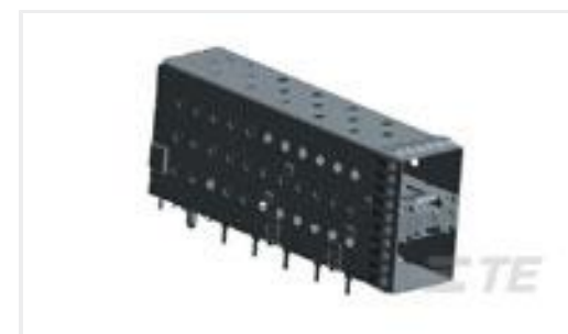
TE Part #1-2007492-5 SFP+assy 2x1 EMI Springs 4LP Sn Enhanced