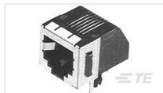
TE Part #5555140-1 MJ,LPF,R/A,6P/6C,SHLD,PNL GRD