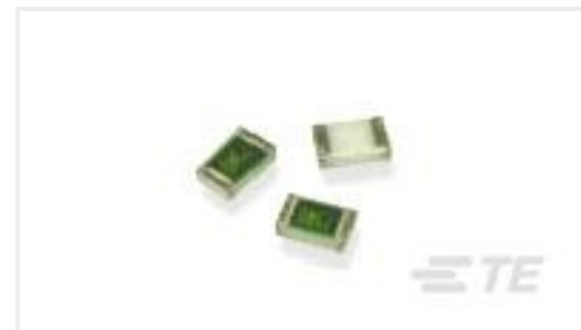
TE Part #7-2176093-7 RP 2A 0.25W 64K9 0.1% 25PPM 1K RL