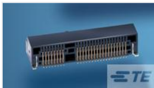
TE Part #2041262-1 Mini PCI-E 6.8H G/F