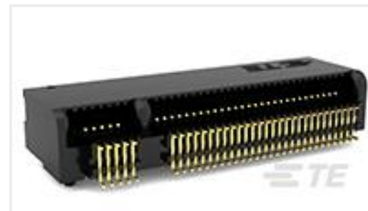
TE Part #1-2199230-5 M.2 0.5PITCH 4.2H KEY M 15U" AU"