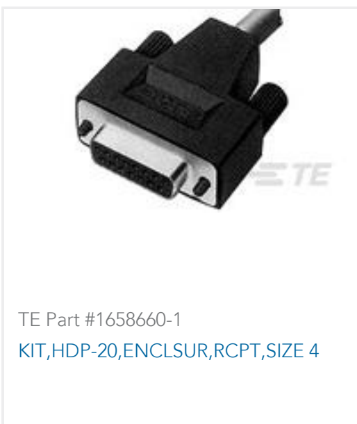
TE Part #1658660-1 KIT,HDP-20,ENCLSUR,RCPT,SIZE 4