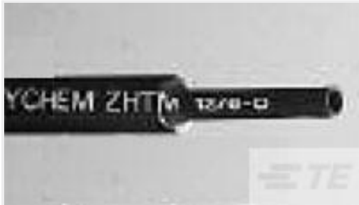
TE Part #2155384003 ZHTM-12/6-0-SP