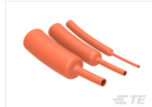
TE Part #CAT-HST-RNF3000 RNF-3000 Heat Shrink Tubing