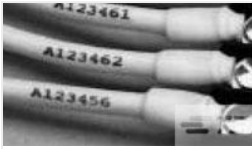
TE Part #5070084031 RNF-100-1/2-X-SP