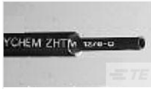
TE Part #2023374003 ZHTM-5/2.5-0-SP