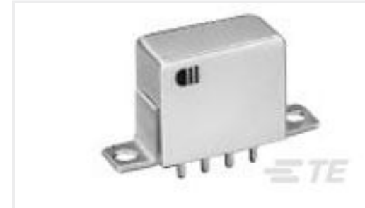
TE Part #1617003-6 B07B332BC1 = B07 10 AMP FULL S