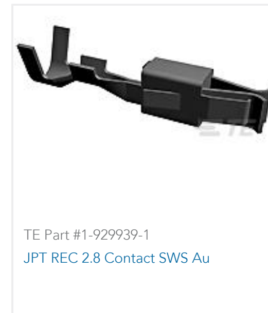
TE Part #1-929939-1 JPT REC 2.8 Contact SWS Au