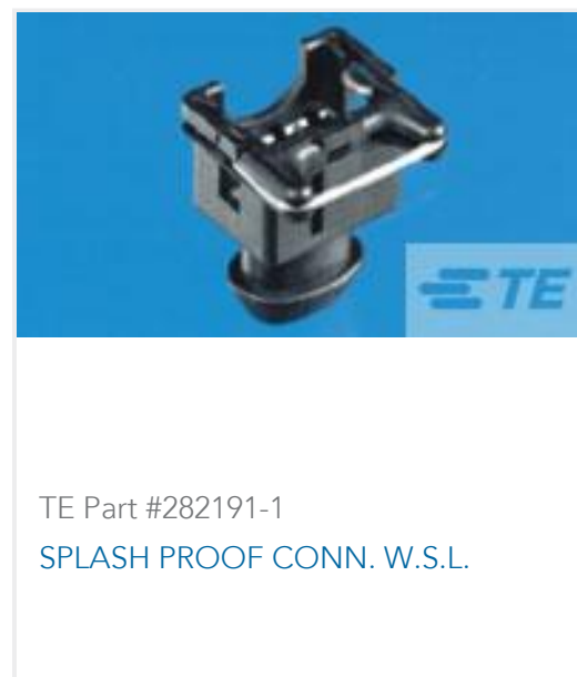
TE Part #282191-1 SPLASH PROOF CONN. W.S.L.