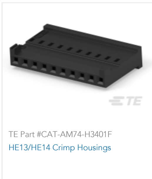
TE Part #CAT-AM74-H3401F HE13/HE14 Crimp Housings