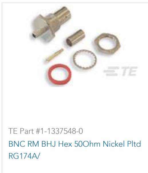
TE Part #1-1337548-0 BNC RM BHJ Hex 50Ohm Nickel Pltd RG174A