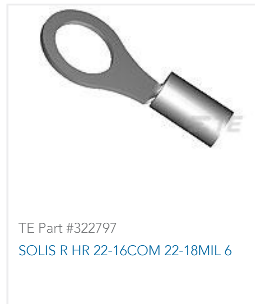
TE Part #322797 SOLIS R HR 22-16COM 22-18MIL 6