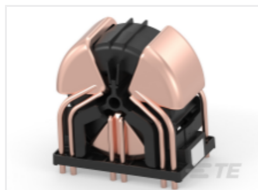
TE Part # 824051-SF RT8532-85-0M2