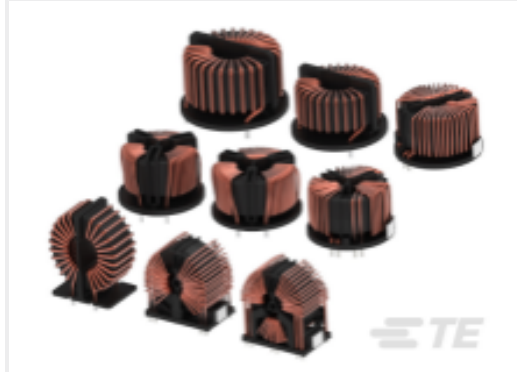
TE Part # CAT-PA3-RT EMC / RFI Chokes RT Series & RT Series N: High-Performance Chokes for Demanding Applications