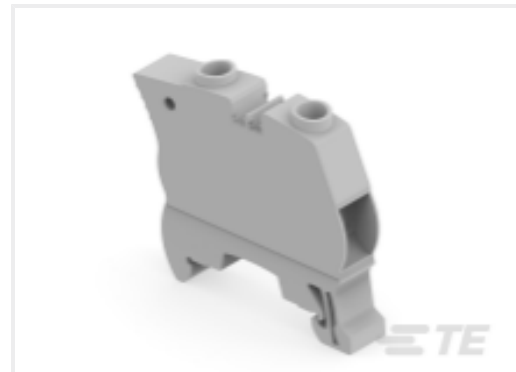
TE Part #1SNK510010R0000 ZS16