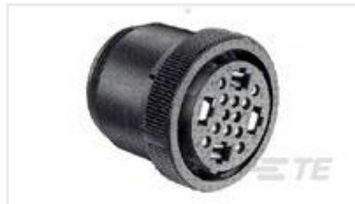
TE Part #207485-1 CPC PLUG ASSEMBLY SIZE 23-16