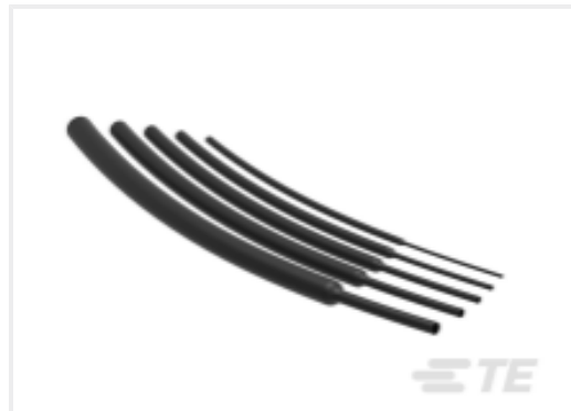
TE Part #CAT-HST-RNF100-0 RNF-100-0 Heat Shrink Tubing