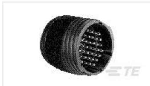
TE Part #206705-2 CPC 13-9 FREE HANGING RECPT