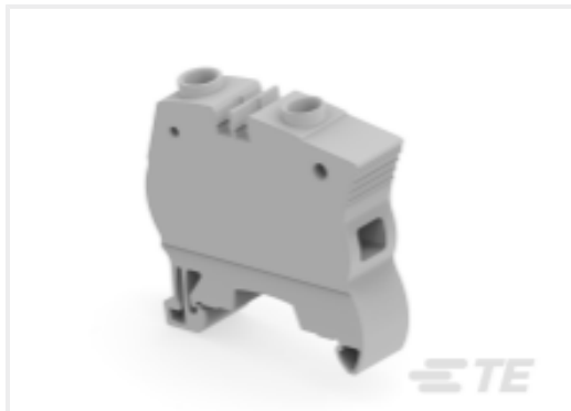
TE Part #1SNK512010R0000 ZS25