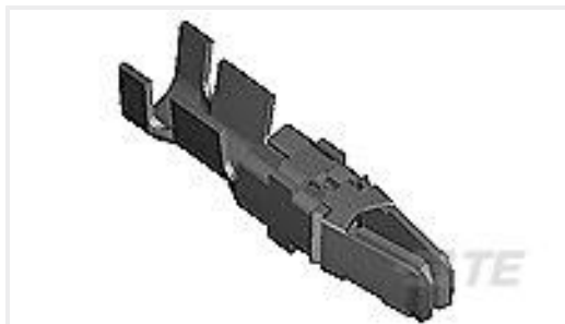
TE Part #66740-6 TYPE XII FEMALE CONT (L.P.)