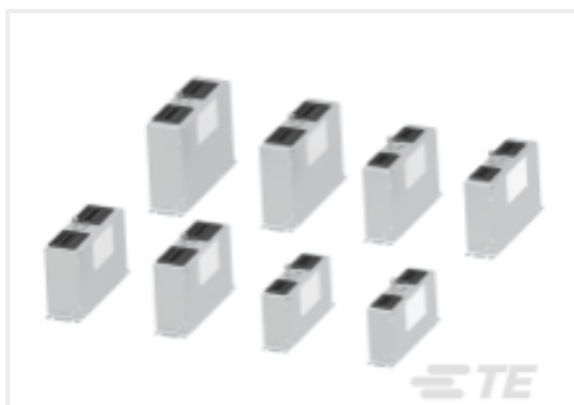
TE Part # CAT-PA0-F3298 SCHAFFNER FN3298 3-PHASE+N FILTER SERIES